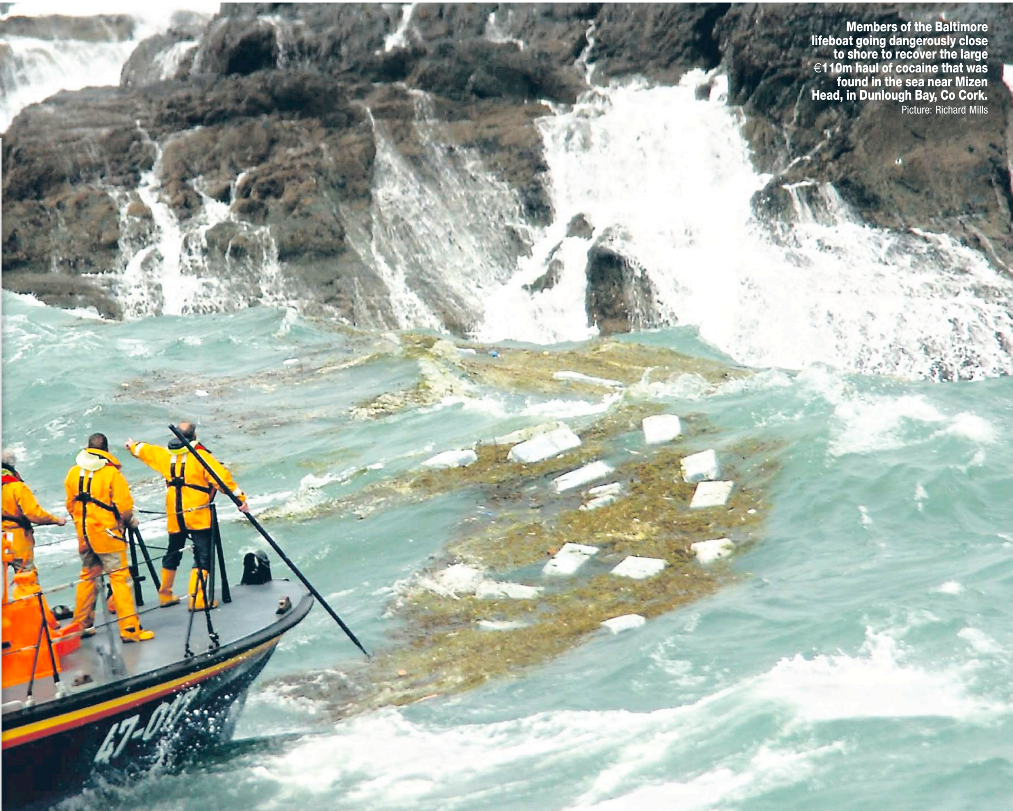
Members of the Baltimore lifeboat going dangerously close to shore to recover the large €110m haul of cocaine that was found in the sea near Mizen Head, in Dunlough Bay, Co Cork.