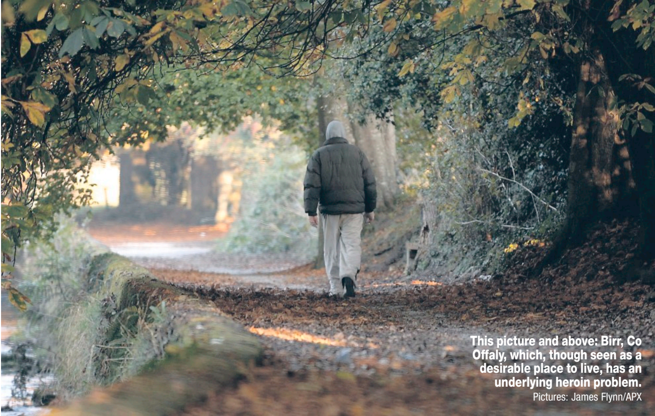
This picture and above: Birr, Co Offaly, which, though seen as a desirable place to live, has an underlying heroin problem.

Q. How many people are registered as drug users in Offaly and the midlands area? How many people living in the county are on a methadone programme? A. 152 clients attended clinics and GPs in 2007, 32 from Offaly.