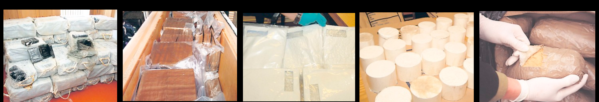
The number of drug seizures have risen, from 5,603 in 2002 to 7,550 last year.

"We checked the implications and we found it had no effect on street dealing or on prices. There was no apparent difference in supply or availability." This trend is reflected across Europe. Research published by the European Monitoring Centre for Drugs and Drug Addiction (EMCDDA) found despite greater seizures, the prices of drugs had actually fallen across the continent. Commenting, the head of the European Commission drug policy unit, Carel Edwards, said: "What this seems to suggest is that a lot more drugs are in the system than we estimated. If increased seizures are not having an effect on prices, indeed prices have come down, whatever we are seizing is not hitting the market." The United Nations estimated that 42% of all cocaine traffic was intercepted in 2006, almost twice the amount seized in 2002. But despite this, the UN said the consumption of the drug had increased significantly in Europe, doubling or tripling in several countries. Ireland was among the