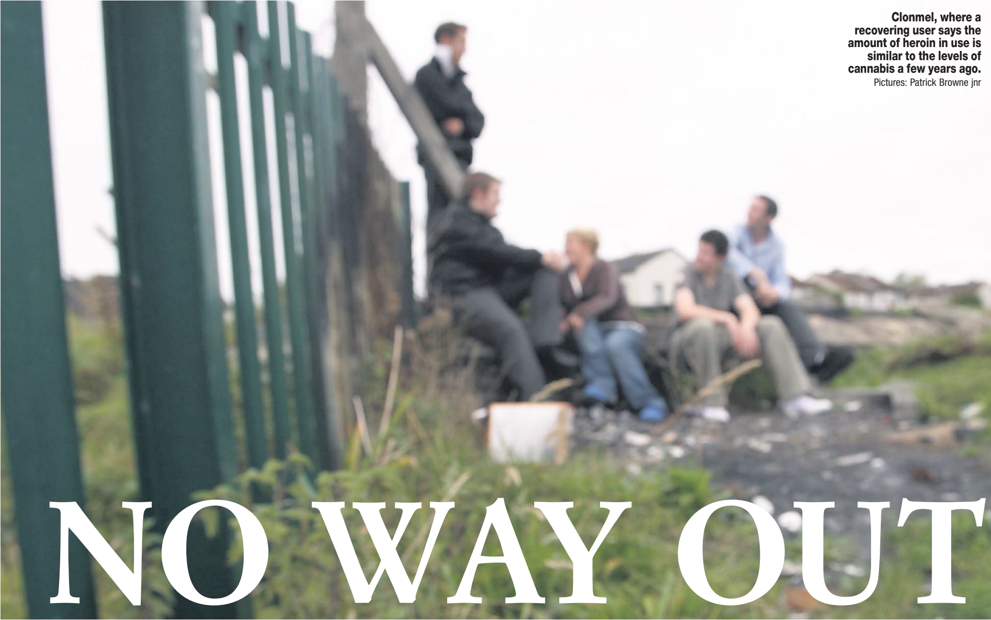
Clonmel, where a recovering user says the amount of heroin in use is similar to the levels of cannabis a few years ago.