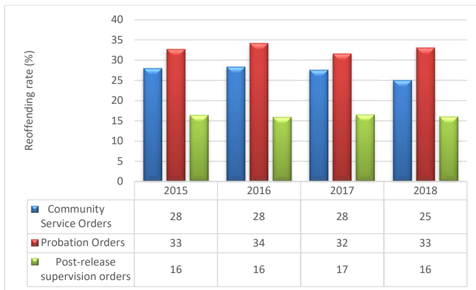
Figure T3.2.2 Proportion of Community Service Orders, Probation Orders and post-release supervision orders received, 2015 and 2018