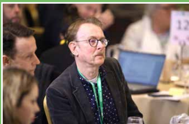
Figure 1.13: Roundtable discussions