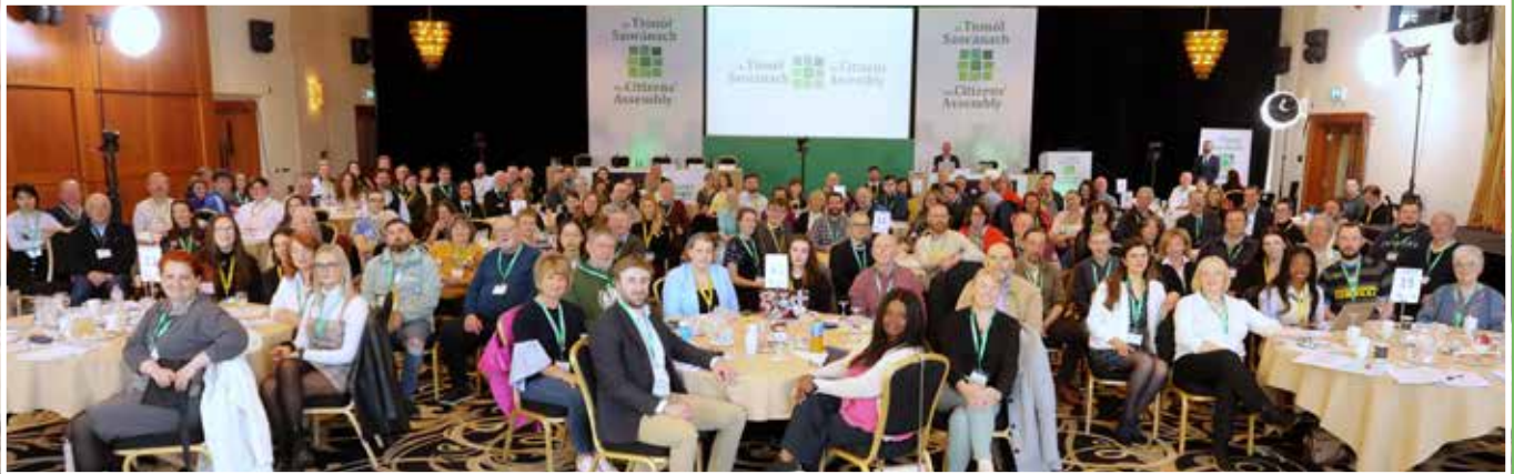
Figure 1.1: Group photo of Members of the Citizens' Assembly on Drugs Use