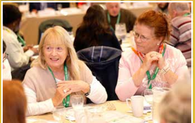
Figure 4.18: Roundtable discussions