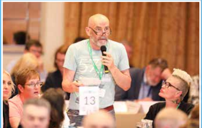
Figure 3.20: Questions and Answers