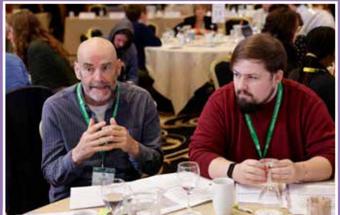
Figure 5.14: Roundtable discussions