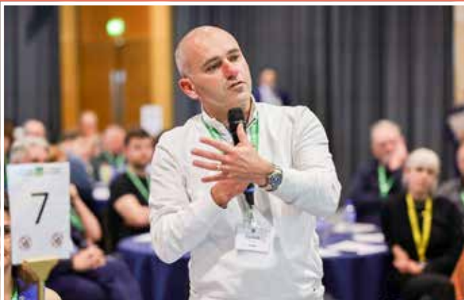
Figure 2.12: Questions and Answers