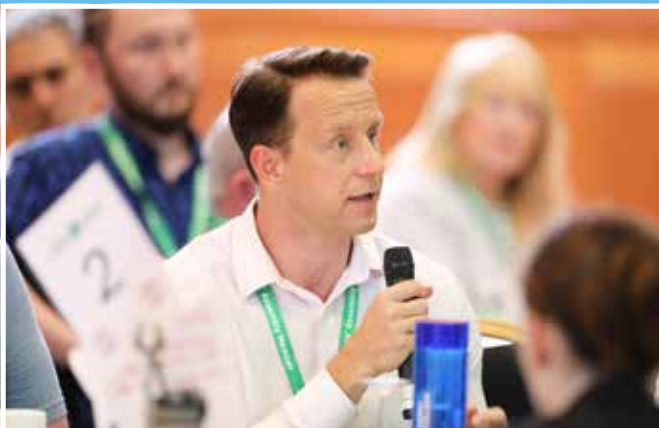
Figure 3.21: Questions and Answers