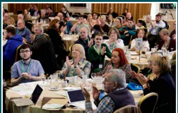
Figure 6.23: Members applaud the end of the Citizens' Assembly on Drugs Use