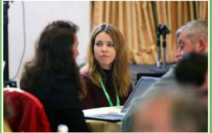
Figure 1.17: Roundtable discussions