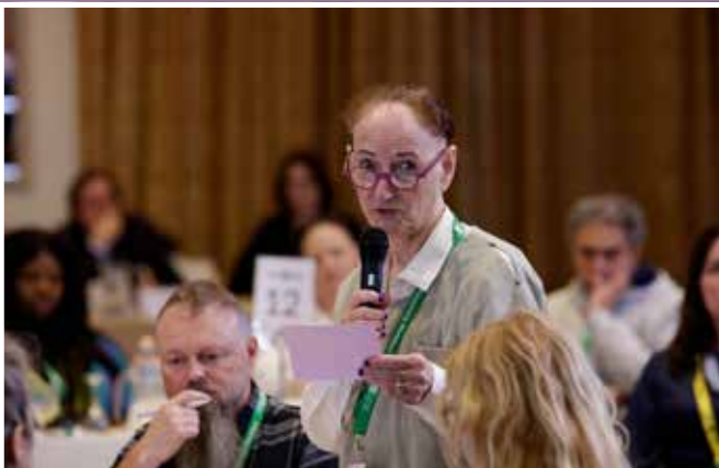
Figure 5.21: Questions and Answers