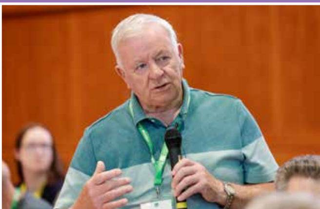
Figure 5.23: Questions and Answers