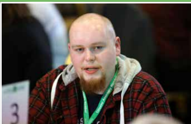
Figure 1.21: Roundtable discussions