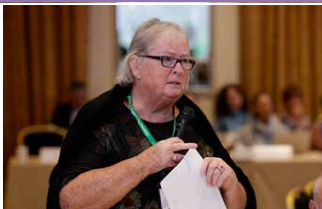
Figure 5.15: Questions and Answers