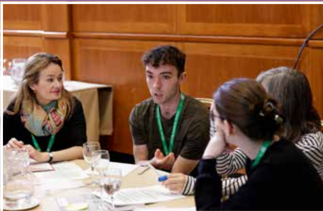
Figure 5.11: Roundtable discussions