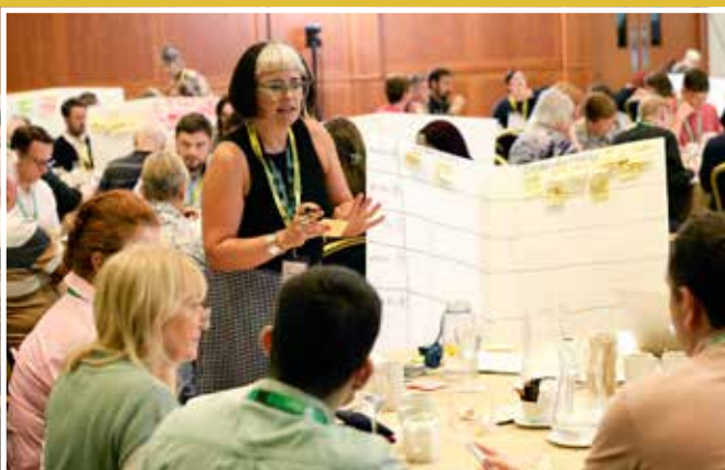
Figure 4.21: Workshop on legal options