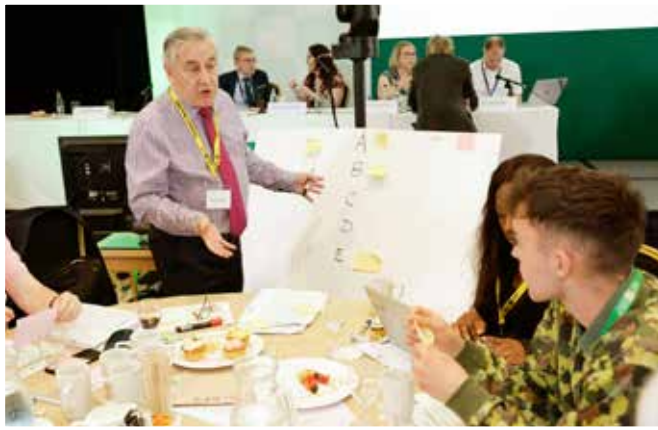
Figure 4.23: Workshop on legal options