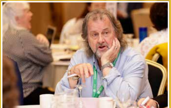
Figure 4.20: Roundtable discussions