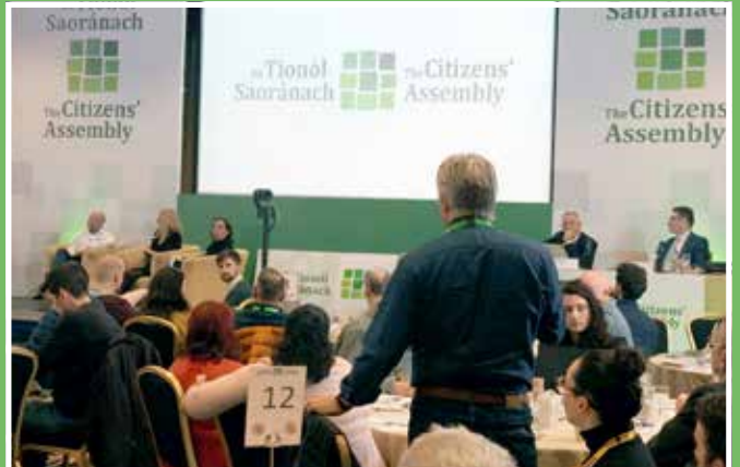
Figure 1.19: Questions and Answers