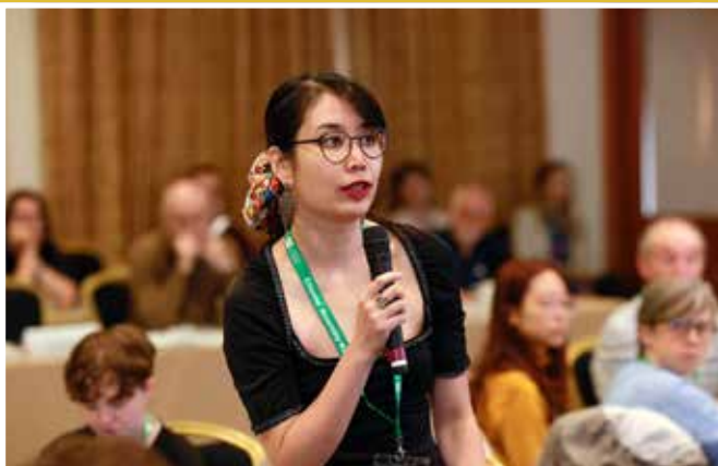
Figure 4.27: Questions and Answers