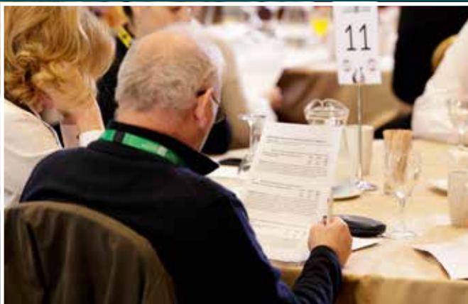
Figure 6.10: Members discuss Ballot Papers