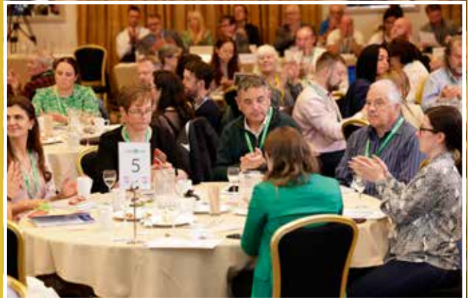
Figure 4.26: Questions and Answers