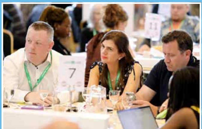
Figure 3.16: Roundtable discussions