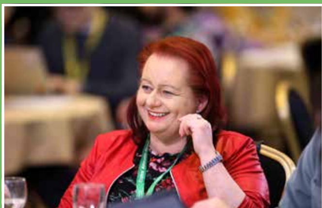
Figure 1.14: Roundtable discussions