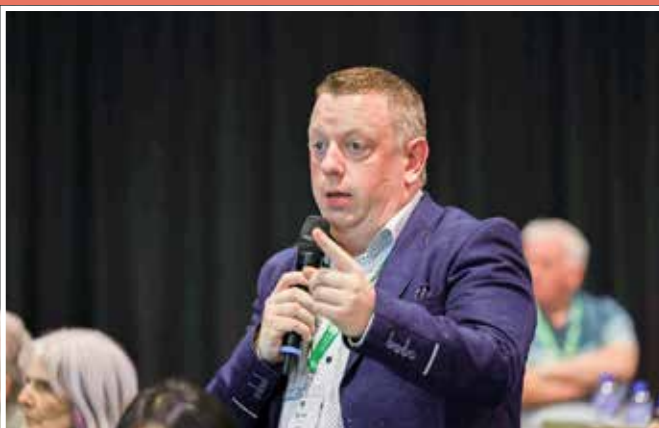
Figure 2.14: Questions and Answers