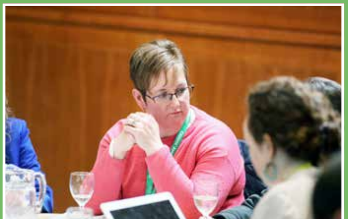
Figure 1.22: Roundtable discussions