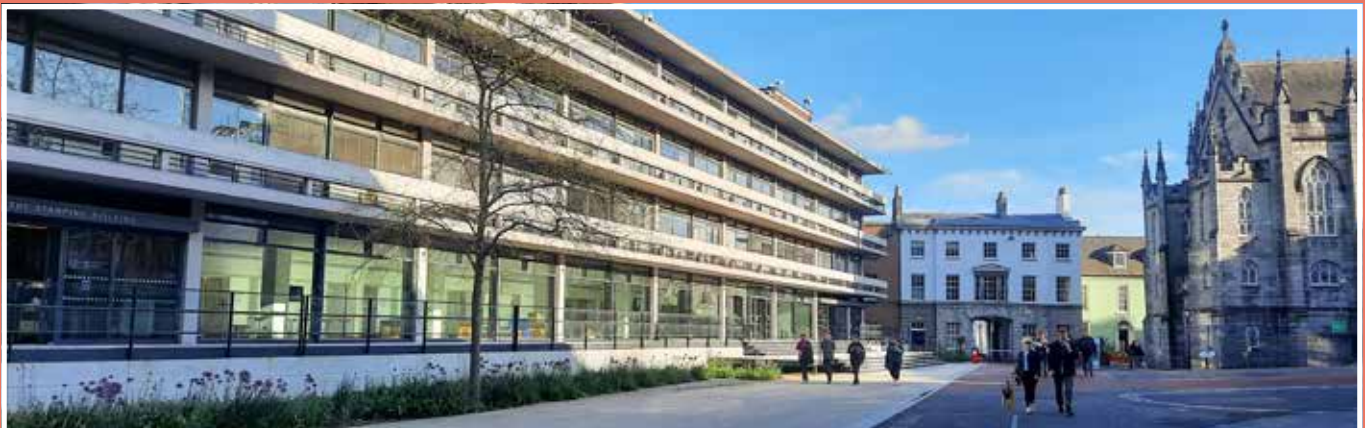
Figure 2.5: The Printworks - Dublin Castle