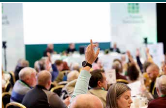
Figure 6.6: Members decide on the wording of Ballot Papers