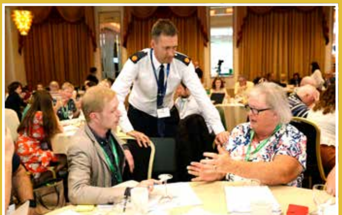
Figure 4.22: Questions and Answers