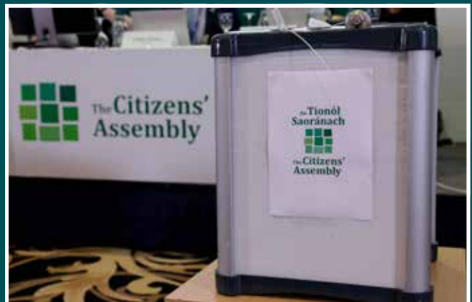
Figure 6.3: Citizens' Assembly Ballot Box