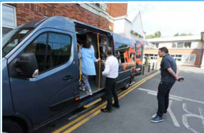
Figure 3.11: 'The VanaLiffey' – Ana Liffey Drug Project's mobile harm reduction unit