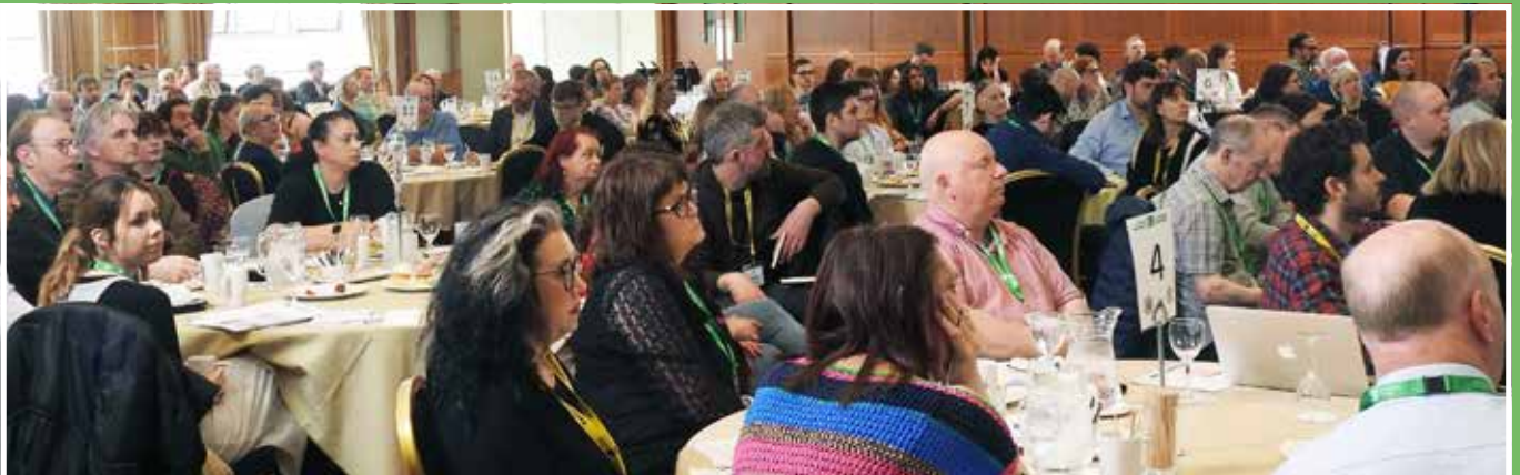
Figure 1.20: Group photo