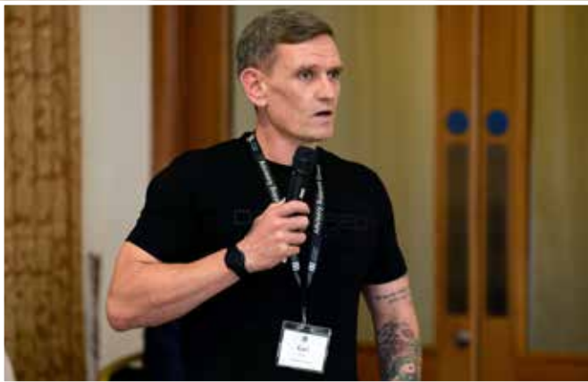
Figure 4.10: Contribution from Karl Ducque