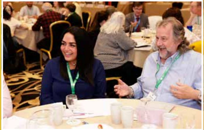
Figure 4.24: Roundtable discussions