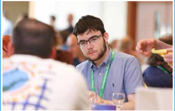
Figure 3.18: Roundtable discussions