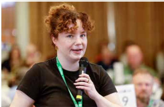
Figure 4.25: Questions and Answers