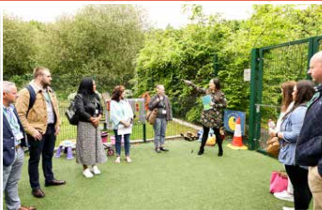
Figure 2.10: Site visit to Coolmine