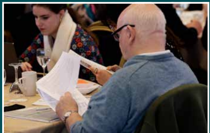
Figure 6.7: Members discuss Ballot Papers