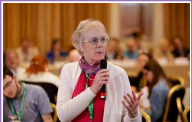
Figure 5.24: Questions and Answers