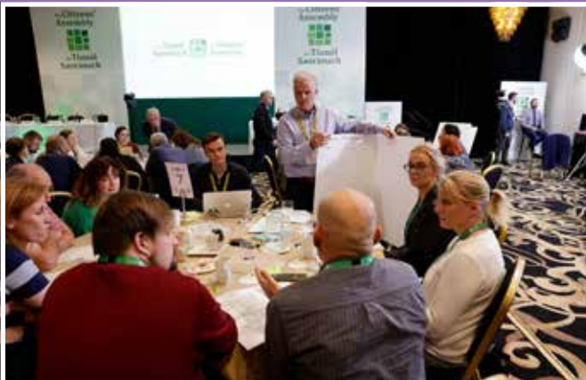
Figure 5.13: Workshop on legal options