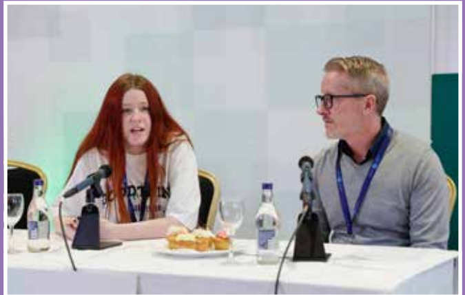
Figure 5.10: Clondalkin Drug and Alcohol Task Force Prevention Model - Sive Brennan, Trevor Bissett