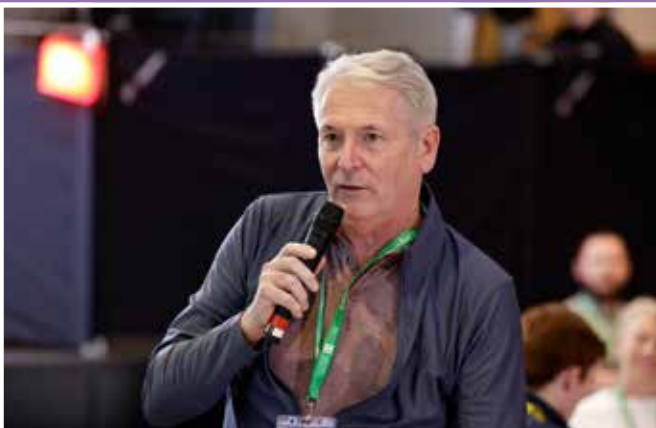
Figure 5.19: Questions and Answers