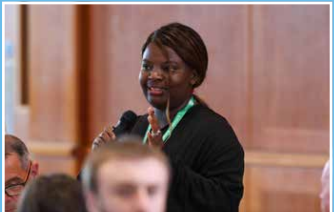
Figure 3.22: Questions and Answers