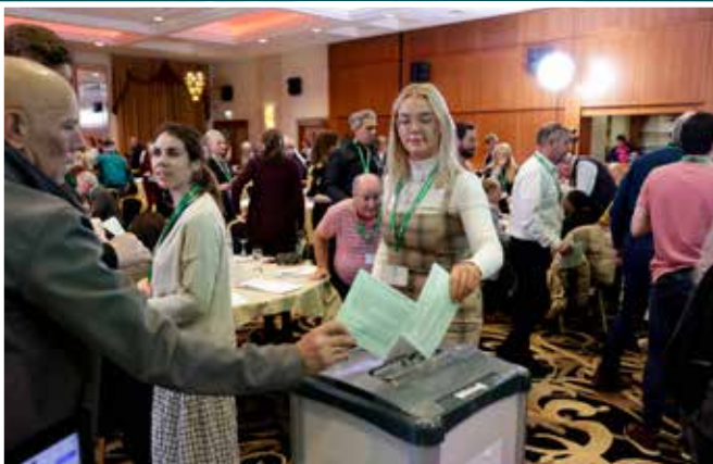
Figure 6.18: Members Vote