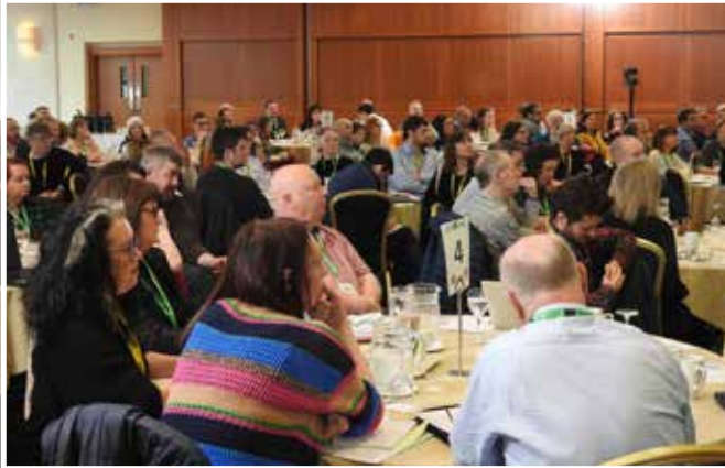
Figure 1.16: Group photo