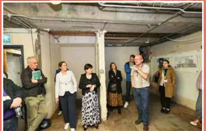
Figure 2.11: Site visit to planned supervised injection facility at Merchant's Quay Ireland