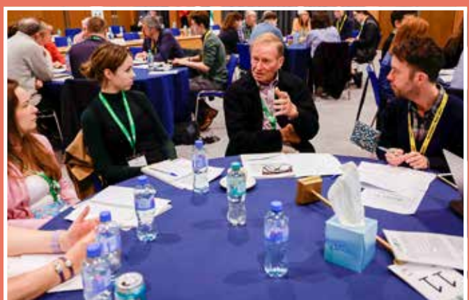
Figure 2.7: Roundtable discussions