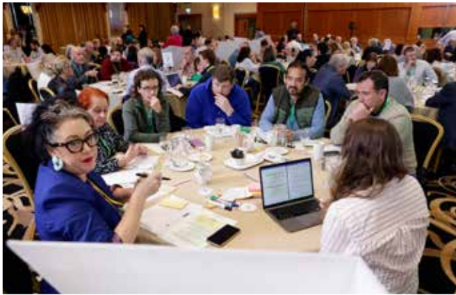
Figure 5.17: Roundtable discussions