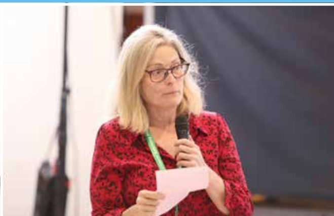
Figure 3.23: Questions and Answers