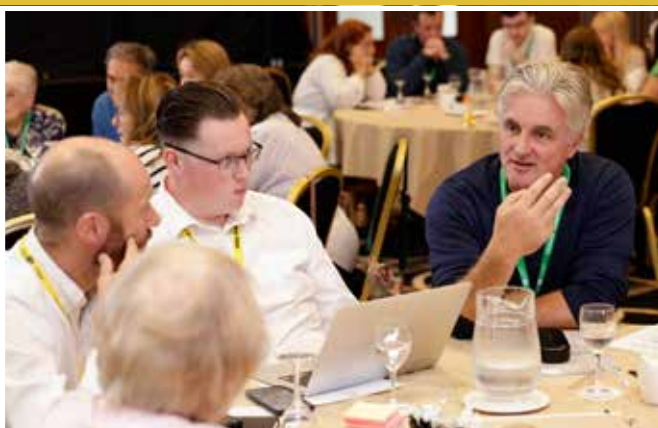
Figure 4.29: Legal Workshop