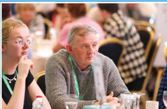
Figure 3.15: Roundtable discussions