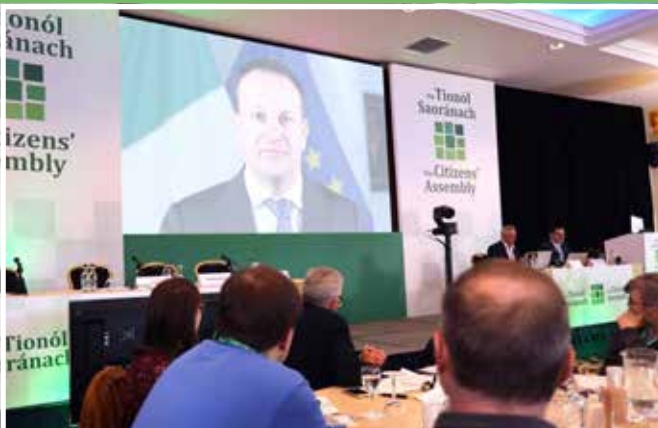
Figure 1.4: Message from Taoiseach Leo Varadkar TD