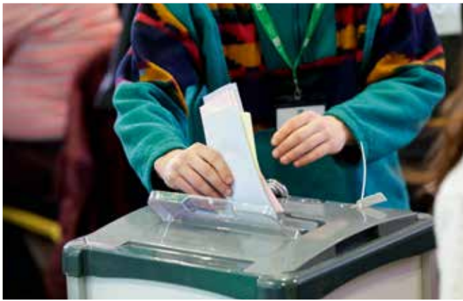
Figure 6.16: Members Vote