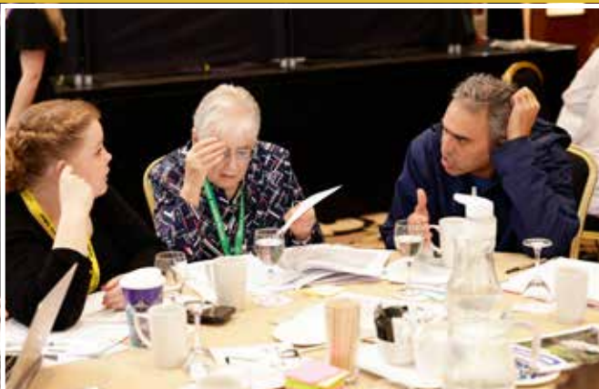
Figure 4.19: Roundtable discussions