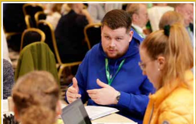
Figure 4.30: Legal Workshop