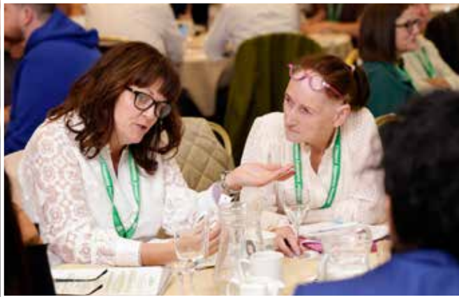
Figure 4.15: Roundtable discussions