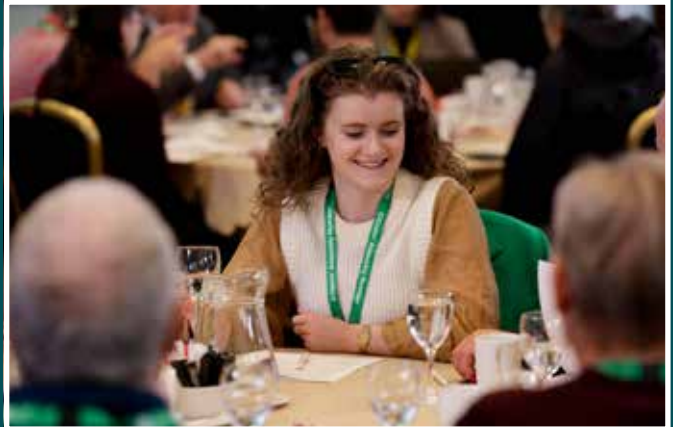
Figure 6.9: Members discuss Ballot Papers