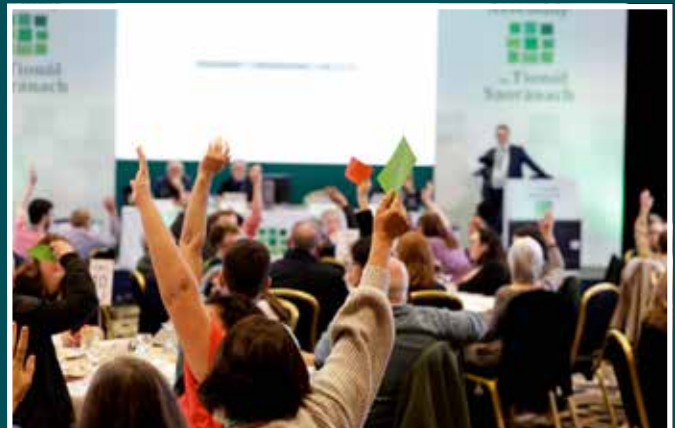
Figure 6.5: Members decide on the wording of Ballot Papers