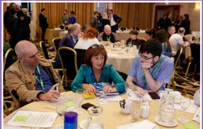
Figure 5.12: Roundtable discussions