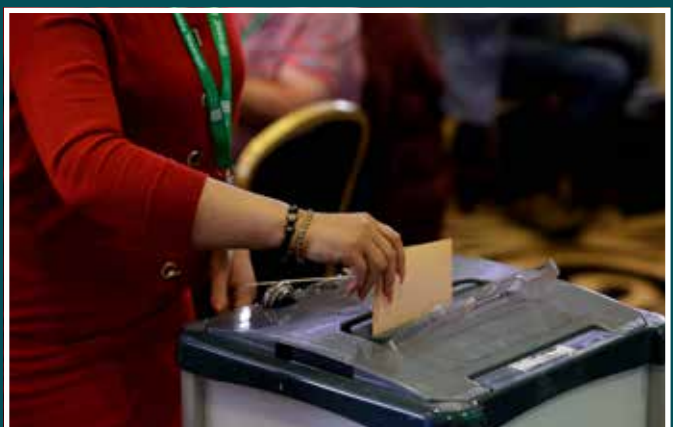
Figure 6.15: Members Vote