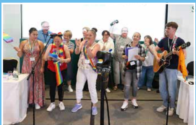
Figure 3.8: Members join the SAOL Sisters on stage