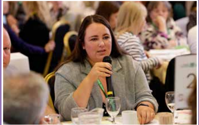
Figure 5.18: Questions and Answers