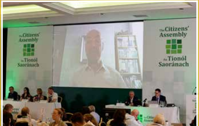
Figure 4.13: Session 6 - Prof. Andrew Percy