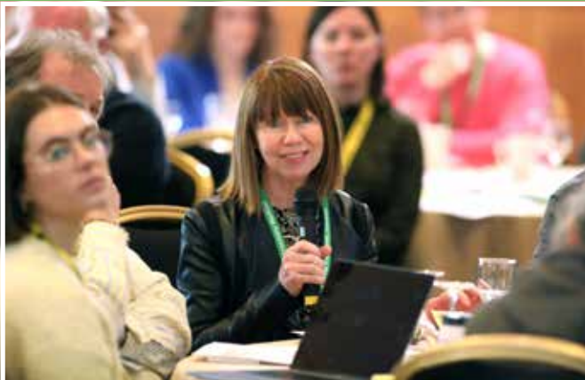
Figure 1.18: Questions and Answers