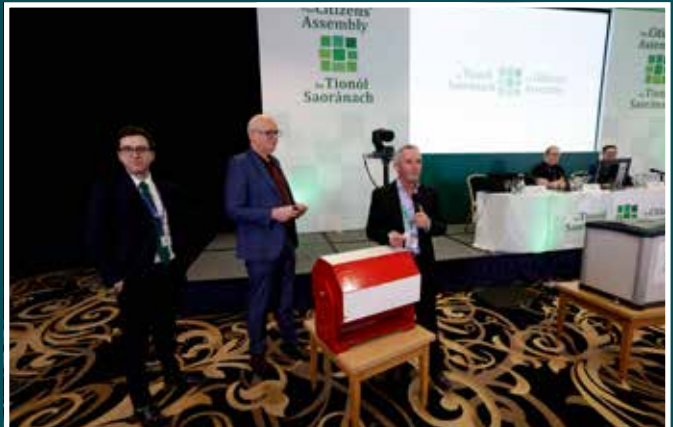
Figure 6.13: Selection of voting scrutineers