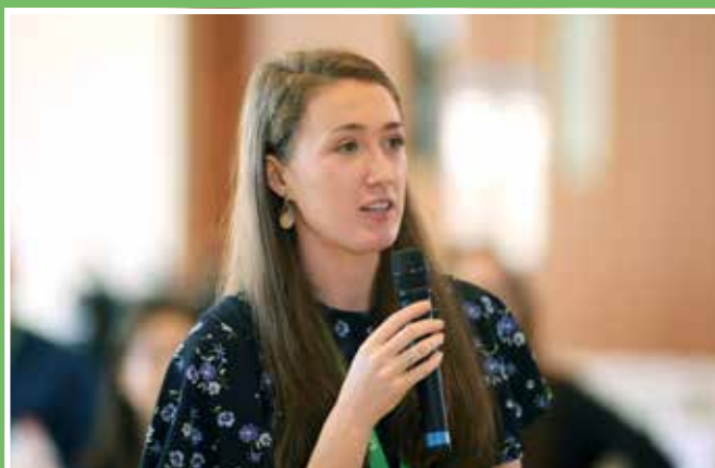
Figure 1.15: Questions and Answers