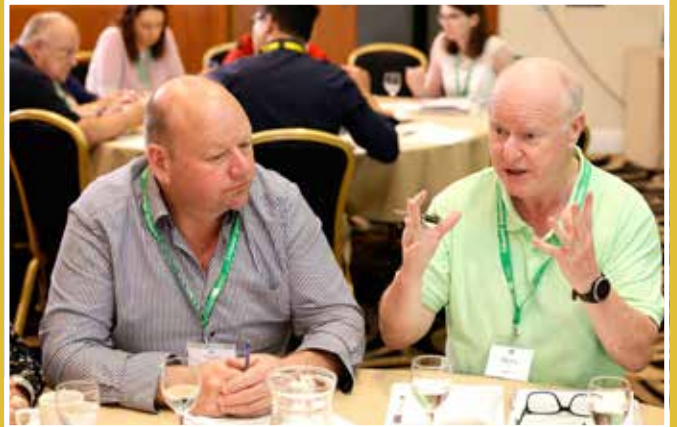
Figure 4.16: Roundtable discussions