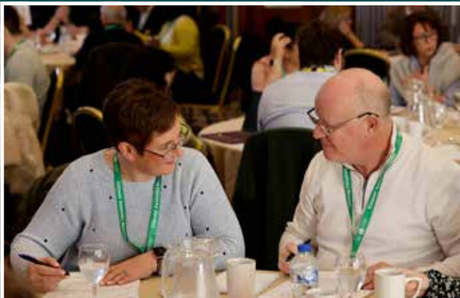
Figure 6.12: Members discuss Ballot Papers