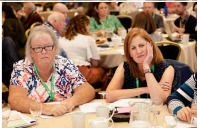
Figure 4.17: Roundtable discussions