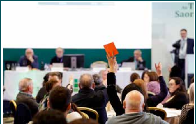
Figure 6.11: Members discuss the wording of Ballot Papers