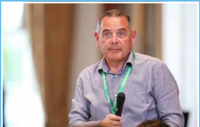
Figure 3.24: Questions and Answers