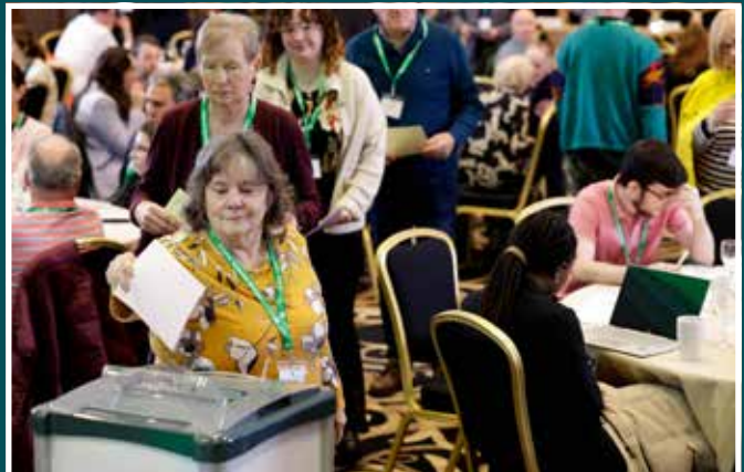
Figure 6.19: Members Vote