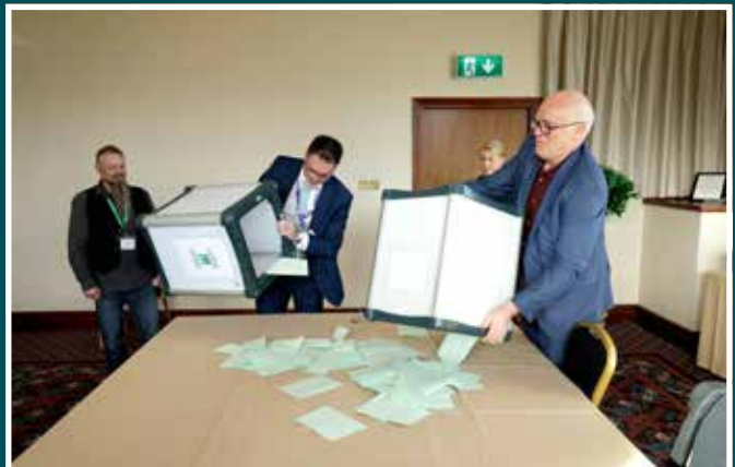
Figure 6.21: Ballot Boxes opened ahead vote count