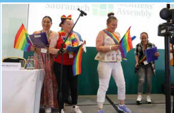
Figure 3.7: SAOL Sisters perform for Members