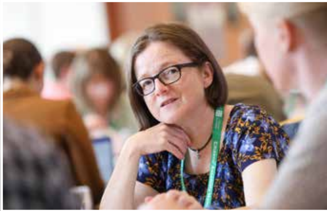
Figure 3.17: Roundtable discussions