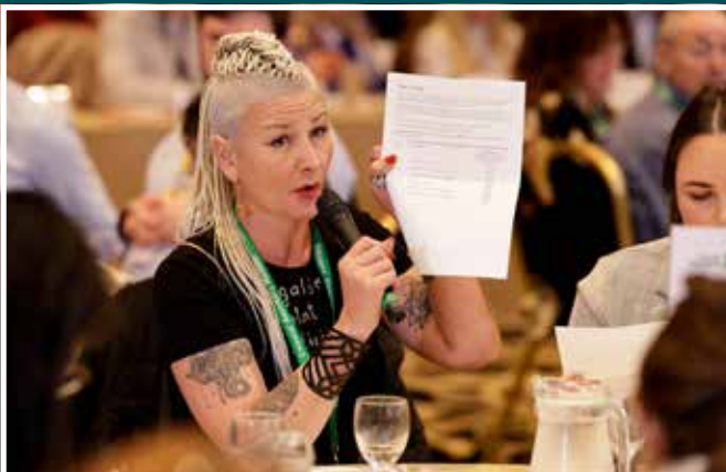
Figure 6.4: Members discuss Ballot Papers