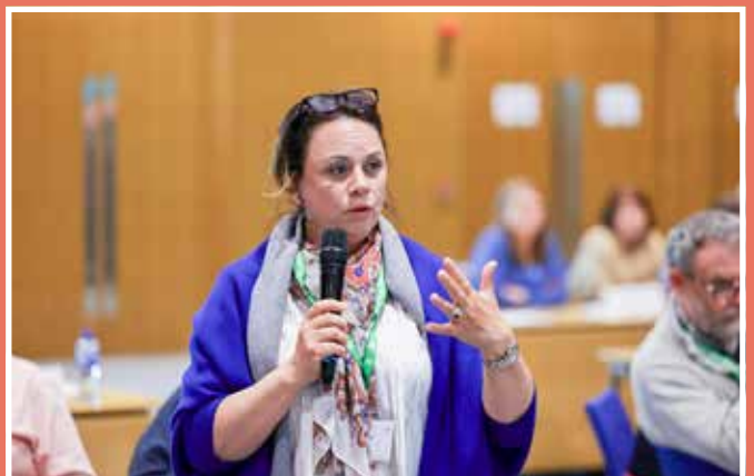
Figure 2.15: Questions and Answers