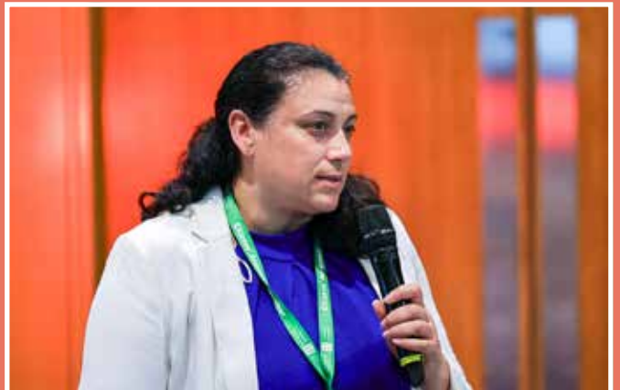
Figure 2.13: Questions and Answers