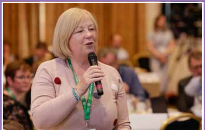
Figure 5.16: Questions and Answers