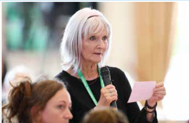
Figure 3.19: Questions and Answers