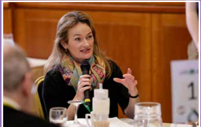
Figure 5.22: Questions and Answers