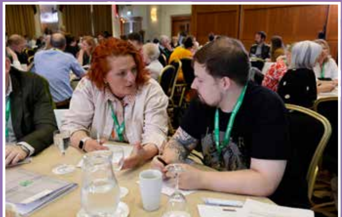
Figure 5.20: Roundtable discussions