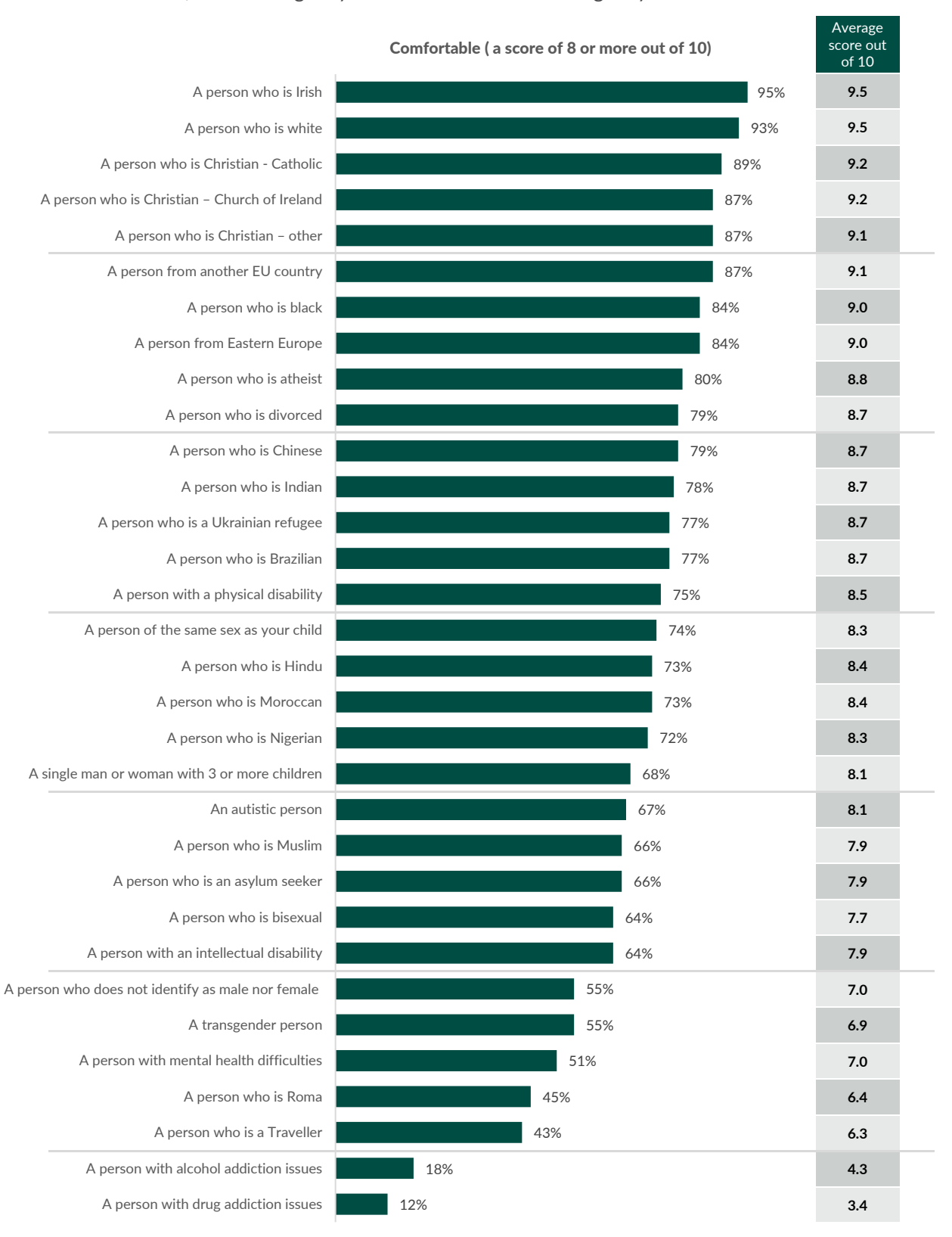
Table 3. Attitude towards participant's child being in a love relationship with someone with a certain characteristic, with 1 being very uncomfortable and 10 being very comfortable

The question asked was "This time please tell me, how uncomfortable or comfortable you would feel if one of your children was in a love relationship with a person from one of the following groups. Using the same scale of '1' means that you would feel "very uncomfortable" and '10' that you would feel "very comfortable". So out of 10, how comfortable would you be if one of your children was in/are in a relationship with ______?".