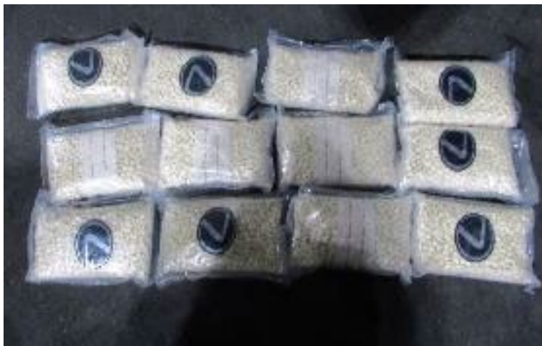
FIGURE 11 Captagon tablets packaged in bags with a Lexus logo