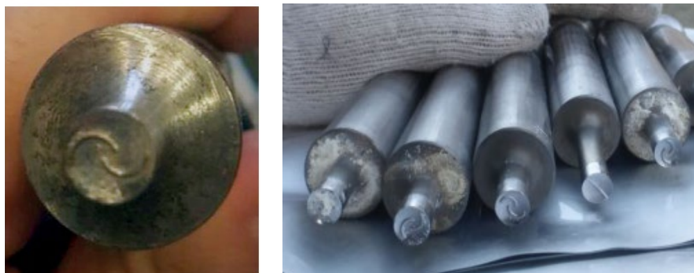
FIGURE 3 Tablet punches with the characteristic Captagon ® logo comprising two half-moons, found in dismantled illicit laboratories

On a note of caution, the information available, including recent information from analyses of captagon tablets seized in Europe, suggests that amphetamine and often caffeine are the psychoactive substances most likely to be present, although it should also be noted that tablet content can vary (for instance, some tablets also contain theophylline). In a limited number of cases, methamphetamine has been found instead of amphetamine (EMCDDA, 2018b).