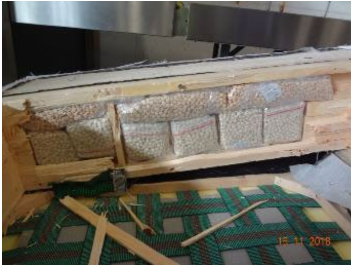
FIGURE 4 Captagon tablets concealed within furniture, Germany, 2018

that the load originated in Germany, when in fact it came from Syria. Forensic analysis of the tablets in this case showed that they matched tablets that had been seized in Lebanon in 2018 or before (samples provided in March 2018 by the Lebanese authorities).