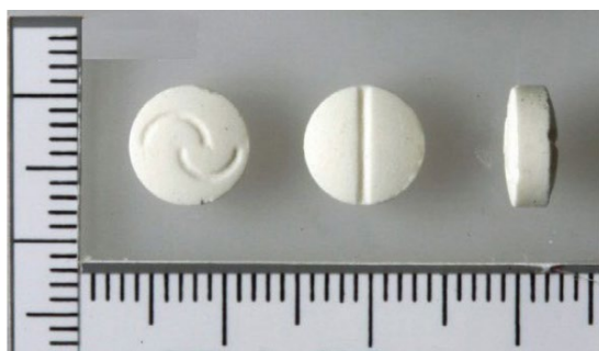
FIGURE 2 Examples of illicit captagon tablets