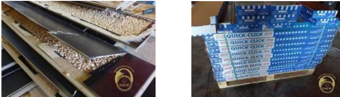
FIGURE 7 Captagon tablets concealed within packs of MDF flooring planks, Greece, 2019

In cooperation with the US Drug Enforcement Administration, in June 2019, again in Piraeus Port, 33 million captagon tablets were concealed inside medium-density fibreboard (MDF) planks (see Figure 7). The planks were found in three shipping containers from Syria, with the final destination listed as China.