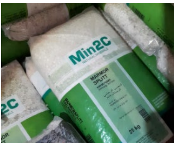
FIGURE 5 Packages of marble stones used to conceal captagon tablets, Germany, 2021

The second case, from May 2021, was a seizure of 234 kilograms of captagon tablets in Bavaria, concealed in bags of small marble stones from Austria (see Figure 5). A suspect in this case, and the person believed to be behind the scheme, was a Lebanese national, who also featured in cases investigated by Austrian police. Some of the tablets in this case were subsequently linked by forensic examination to the third German seizure in August 2021, also in Bavaria, when 170 kilograms of captagon tablets was seized on the road network during a random traffic control. The suspects in this case were two Turks, a Greek and a Romanian.