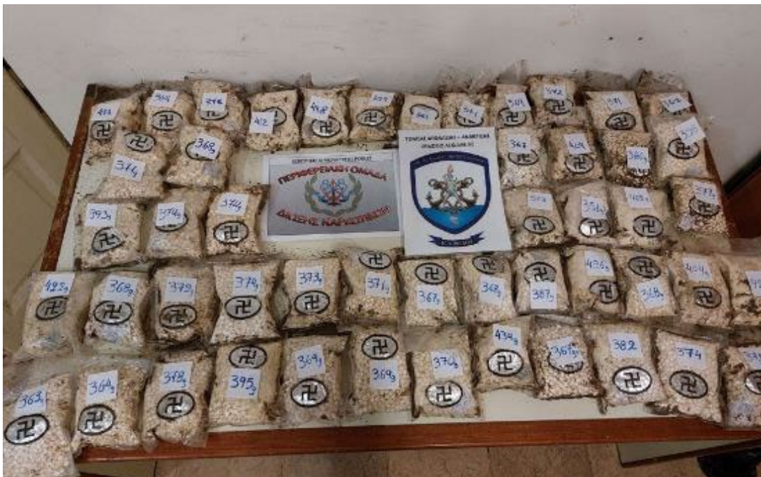
FIGURE 8 Captagon tablets in packaging bearing inverted Swastika, Greece, 2022

Finally, in January 2022 over 180 000 captagon tablets were found washed up on the shores of the island of Rhodes. On the same day over 80 000 captagon tablets were found on the shores of the island of Kastellorizo. Shortly afterwards, in February 2022, a further 88 880 captagon tablets were again washed up on the shores of Rhodes. In these cases, the packaging had labels displaying an inverted swastika (the only instance of this detail found in all the cases reported) (see Figure 8).