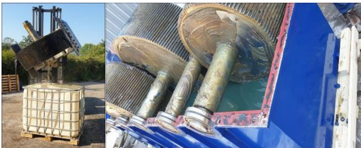
FIGURE 9 Parts of an industrial gearbox used to conceal captagon tablets, Italy, 2020