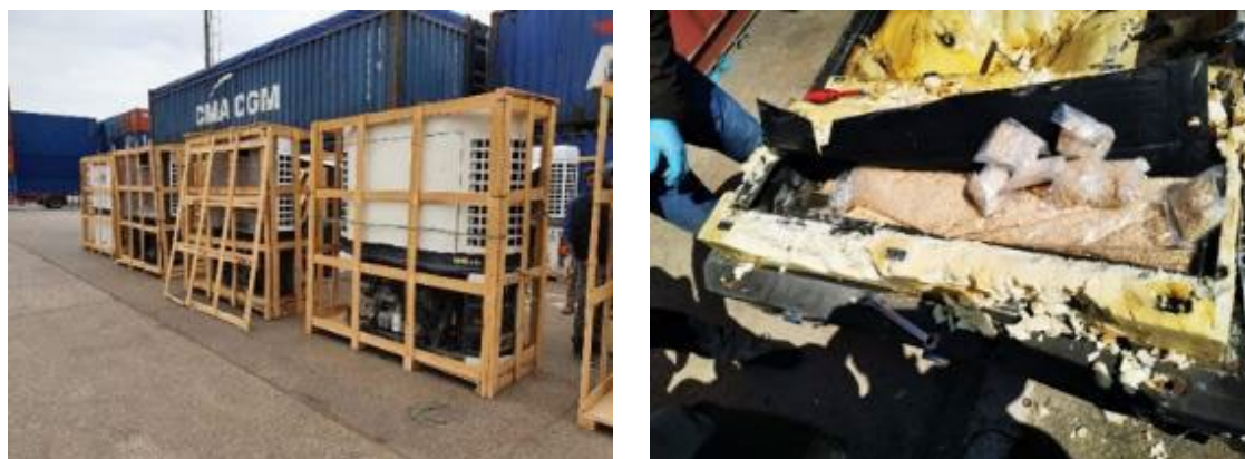
FIGURE 10 Captagon tablets concealed in refrigeration units, Romania, 2020