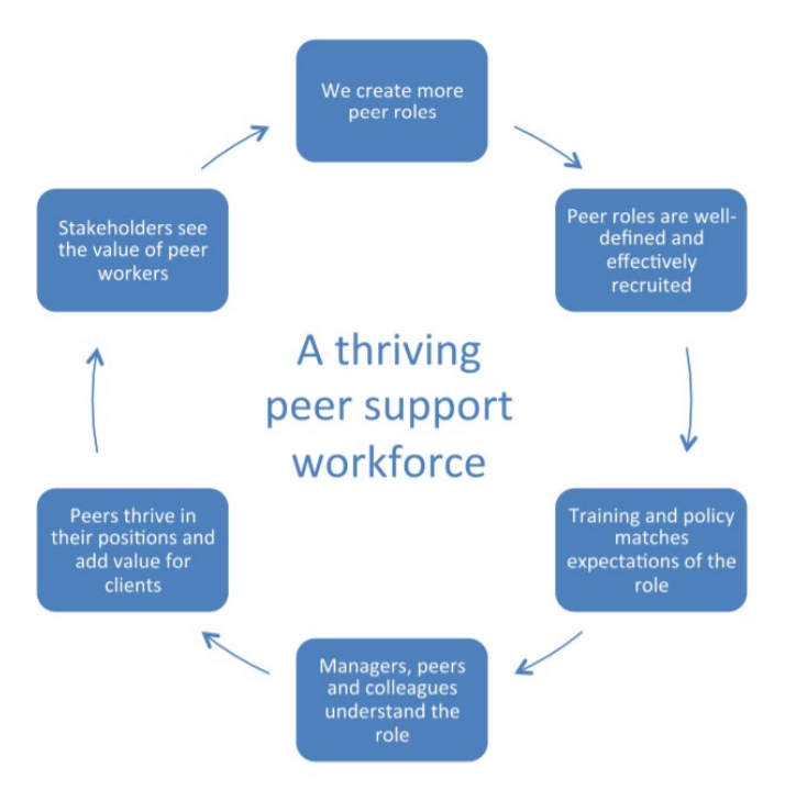
Figure 1. Workforce development to promote a thriving alcohol and drug peer support workforce.

The contrasting situation is a 'surviving' peer support workforce, where poorly defined roles mean everyone disagrees on what constitutes peer support, resulting in high turnover and workers feeling unable to demonstrate their true value (King & Panther, 2014). This highlights the importance of clearly defining gambling peer worker roles to ensure a sustainable workforce.