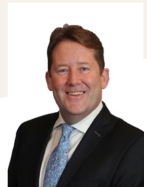
Darragh O'Brien TD Minister for Housing, Local Government and Heritage

The scale of this Strategy is ambitious but, through collaboration with all stakeholders, the objectives will become a reality. Similar to our overarching housing plan, Housing for All, achieving the aims of this Strategy can only happen with a cross-departmental approach, delivered in partnership and collaboration with other Government departments, State bodies and service providers. There will be a strong focus on the implementation of this Strategy, overseen by a Steering Group established under the auspices of the National Homeless Action Committee (NHAC). All actions will be monitored on an ongoing basis. I look forward to working with our partners in the implementation of this Strategy to achieve the best possible outcomes for our young people and their future.