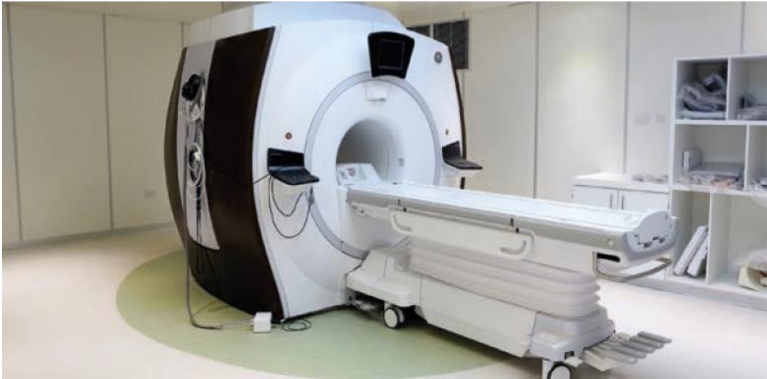
An MRI Unit

The level of funding for the National Equipment Replacement Programme in 2022 is €65m.