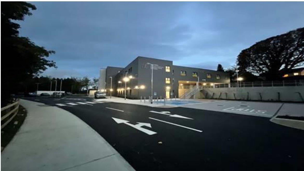
Ballyboden Primary Care Centre, Co. Dublin

Funding is allocated in Capital Plan 2022 to advance a number of projects including Rowlagh/North Clondalkin, Kilbarrack, Finglas, Roxtown (Limerick City) and Portlaoise