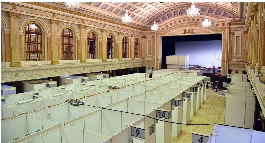
Vaccination Centre Cork City Hall