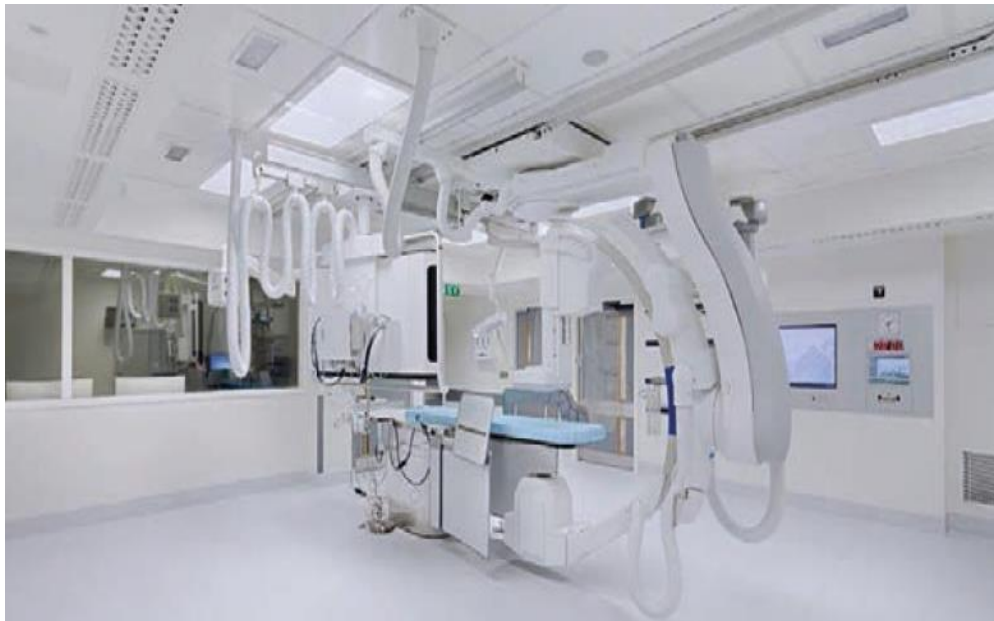
Cardiac Catheterisation Laboratory

For completeness in respect of this heading, refer to appendices 1 & 2