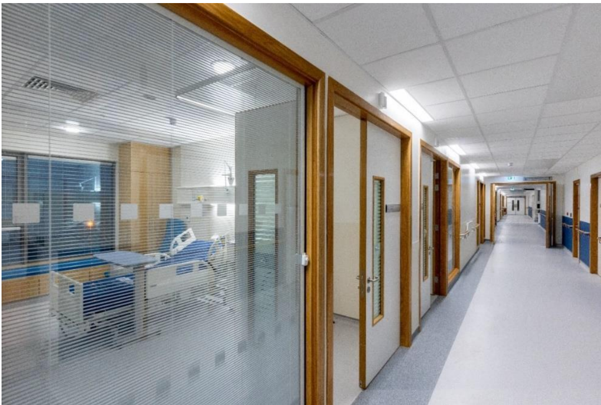
A typical new Ward Block

Projects to progress in 2022 in accordance with the Public Spending Code include a Renal Unit at Letterkenny University Hospital, Ward Blocks at Limerick, Sligo Portiuncula, Beaumont, Galway, Tipperary and Wexford Hospitals, and a Ward Block and HDU Ward at Cappagh Hospital.