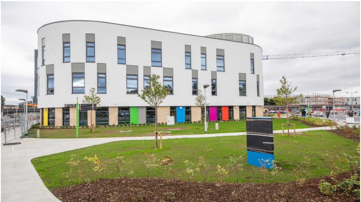
Urgent Care Centre and OPD, Tallaght Hospital, Dublin

The paediatric in-patient ward in Cork University Hospital is progressing through design in 2022, as is the Neurosurgery Rehabilitation Unit for children over six years at Temple Street Hospital.