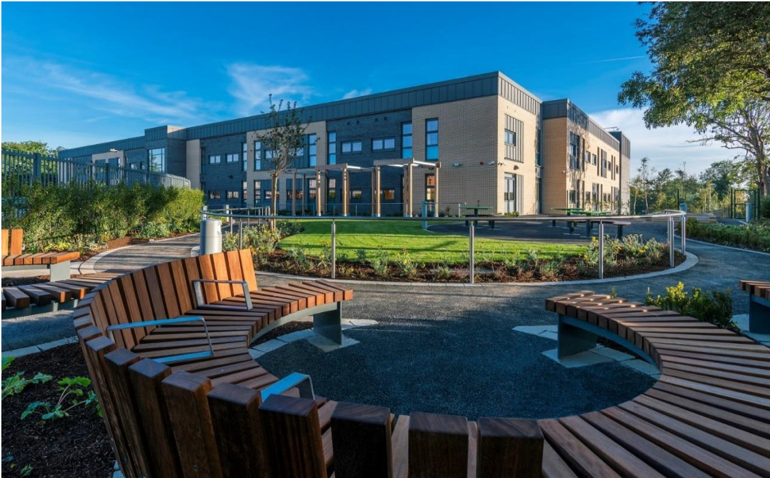
Community Nursing Unit Tymon North, Dublin