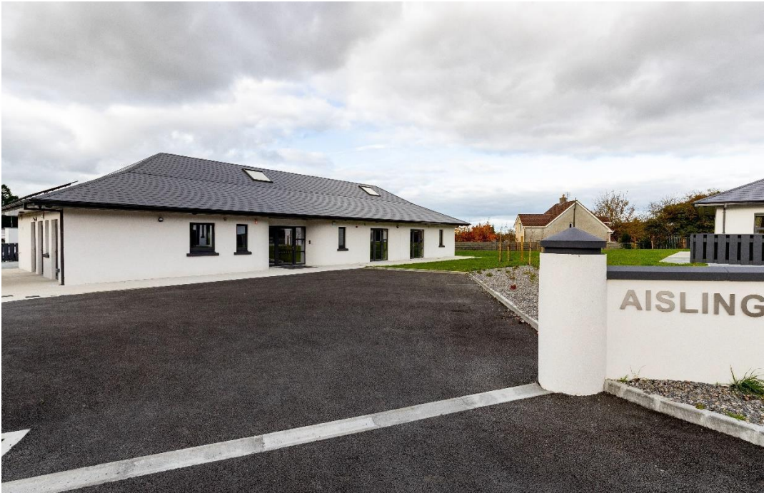
De-congregated Residence, Limerick

The disability de-congregation programme will continue in 2022 with anticipated completion of projects nationwide. These include Cloonamahon, Co. Sligo, Daughters of Charity, Roscrea, Brothers of Charity, Limerick, Daughters of Charity, Limerick, St. Raphael's, Youghal. Further projects will initiate in 2022 as part of the overall programme