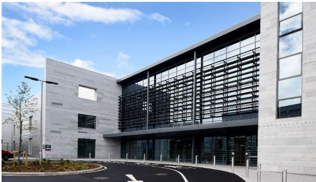
Oncology Facility, Cork University Hospital.

Projects to progress in 2022 include an Oncology Unit at Kerry General Hospital, Aseptic Compounding Units in Tallaght, Letterkenny and Cork University Hospitals and a Haematology Oncology Unit at Dunmway, Cork.