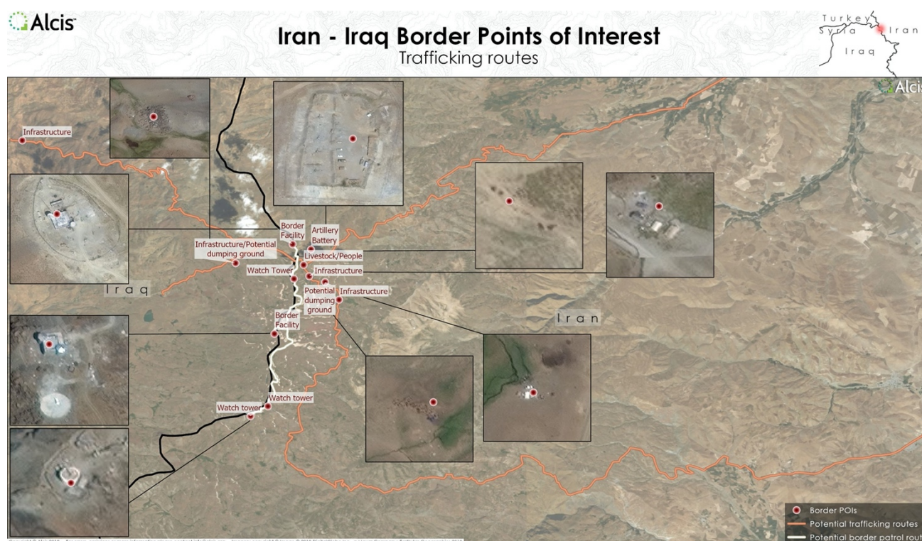
FIGURE 2 Points of interest along a section of the Iran-Iraq border

Based on information provided by key informants, a review of satellite imagery from a section of the border between Iran and the KRI was undertaken (see Figure 2). Through this review, a number of informal crossings were identified based on tracks visibly running across several sections of the border, indicating possible use by vehicles, persons and animals (e.g. donkeys). In addition, several potential sites were identified where smuggled goods could be temporarily stored before being distributed to couriers to be brought across the border. An analysis was also undertaken of formal crossings between Iran and the KRI. Figure 3 shows the growth of the Sheikh Saleh border crossing point between Kermanshah Province in Iran and Sulaymaniyah Governorate (KRI). This location was identified as a point of interest by informants due to the large volume of goods that currently cross on a daily basis and the low level of monitoring by authorities on either side. The Sheikh Saleh crossing was officially approved by the Iranian parliament on 7 August 2019. However, as indicated by key informants and verified by the satellite imagery, it operated as an informal border crossing for several years. The lack of border infrastructure (as seen in the satellite imagery) and monitoring equipment (as highlighted by key informants) underscores the potential for traffickers to exploit this crossing point for the smuggling of illicit goods.