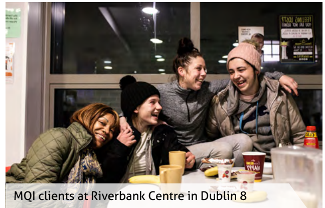
MQI clients at Riverbank Centre in Dublin 8