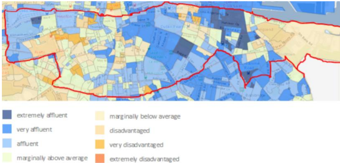
Fig. 1: Map of the SICDATF catchment area.

The socioeconomic profile of the area is diverse, ranging from very disadvantaged pockets to above average affluent sections (Quality Matters 2017). The combined population of the constituencies Dublin South-Central and Dublin Bay South was 240,654 in 2016 (CSO 2016). The area is ethnically diverse, and has a higher than national average population of members from new communities (Quality Matters 2017). The Mendicity Institution, a homeless charity based in the South Inner City, conducted a census amongst its service users in 2019, finding that 75% of its service users were EU migrants, primarily from Lithuania, Poland and Romania, and that 38% were sleeping rough (Mendicity 2019).