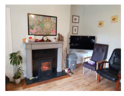
Maryville sitting room after work completed