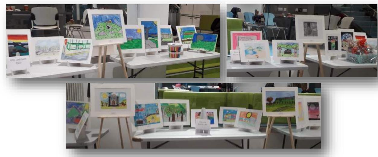
Sligo Social Services Art Competition Winning entries

Sligo Social Services have always believed that education plays a central role in reducing the risk of poverty and helping people find a way out of poverty. We have worked with children and families for over forty years preparing children for school and supporting them