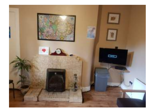
Maryville sitting room before work