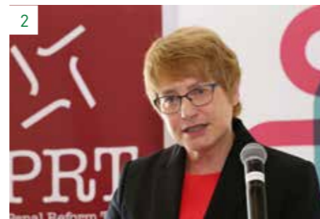
2 Inspector of Prisons, Patricia Gilheaney, at the launch of Progress in the Penal System (2018) , 26 October 2018.