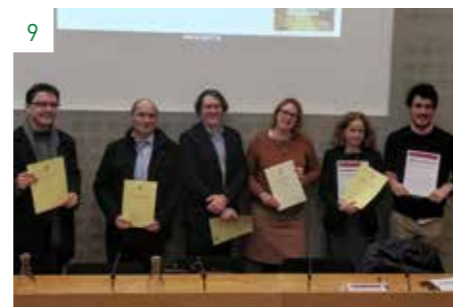
9 Oireachtas Briefing on the Criminal Justice (Rehabilitative Periods) Bill 2018 , 12 February 2019.