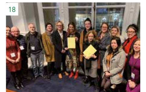
18 Supporters of the Criminal Justice (Rehabilitative Periods) Bill 2018, 13 February 2019.