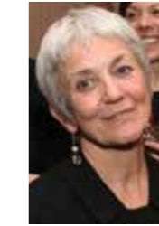
Paula Meehan Poet