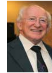
Michael D. Higgins President of Ireland