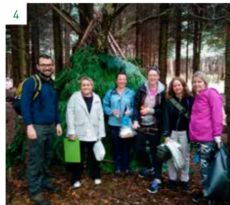
4 IPRT staff at a team building day, 18 September 2018