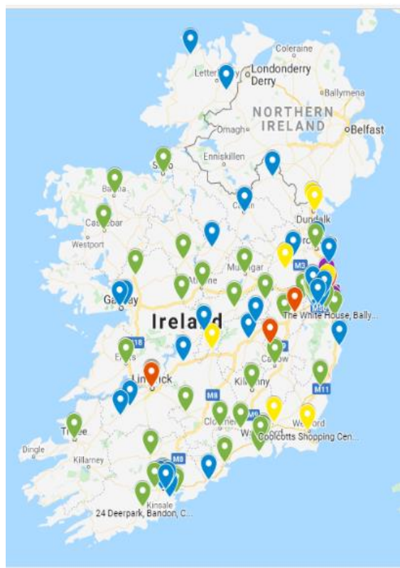
Garda Youth Diversion Project Locations