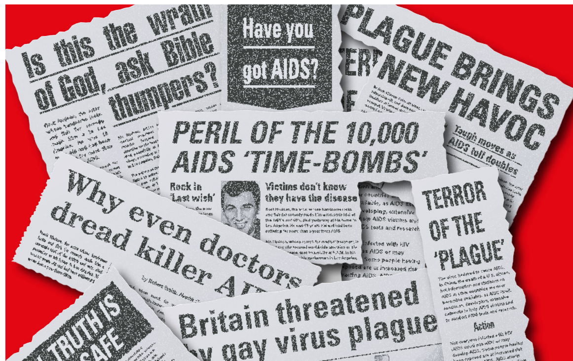
Newspaper Coverage of HIV/AIDS in the 1980s and 1990s

“... these stories do not provide an objective lens through which to understand the broad range of perspectives and lived-realities ...”