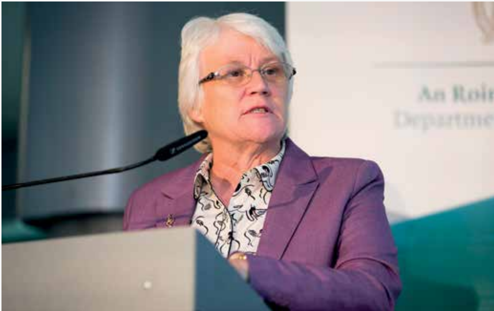
Minister of State with responsibility for Health Promotion and the National Drugs Strategy, Catherine Byrne TD, giving the closing address at the National Drugs Forum