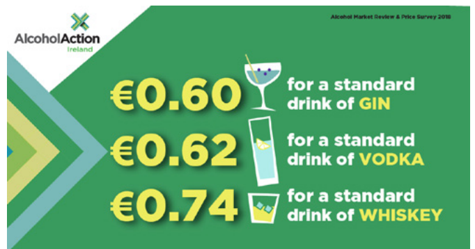
Figure 3: Affordability of Standard Drink: Gin/Vodka/Whiskey