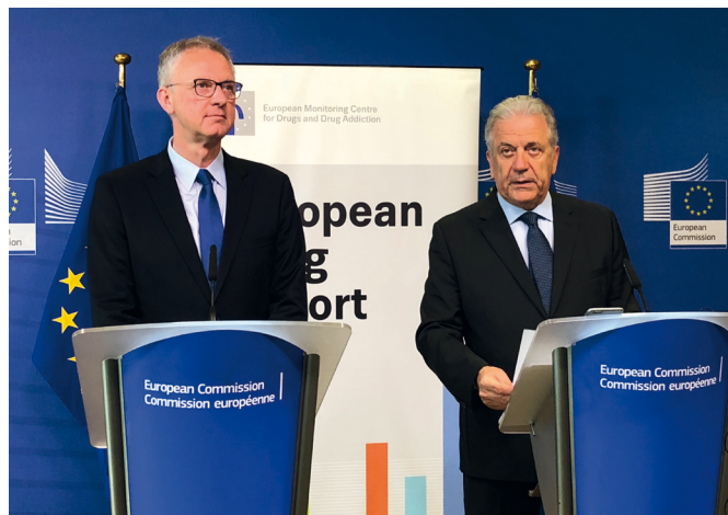
L-R: Alexis Goosdeel, director EMCDDA, and the European Commissioner for Migration, Home Affairs and Citizenship, Dimitris Avramopoulos, at the launch of the 2018 European drug report in Brussels

In Ireland, the number of people aged 15–64 years reporting that they used illicit drugs in their lifetime has risen from 2 in 10 in 2002/3 to 3 in 10 in 2014/15. Cannabis remains the most commonly used illicit drug among this group, followed by MDMA and cocaine. A total of 9,227 cases presented for treatment in 2016.