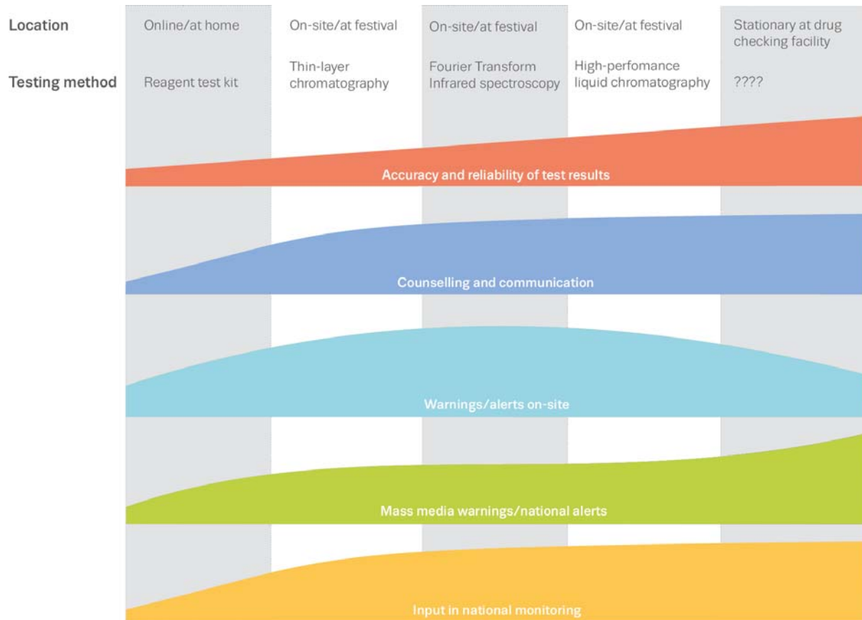
General utility of current types of drug-testing methods used

Finally, the specific aims can differ across the different drug-testing agencies. DIMS is primarily a monitoring instrument that aims to gain information about the drug market for policy purposes and surveillance. This could result in either targeted warnings to a specific user group or mass media campaigns aimed at the general public in the case of compounds that pose additional risks, which depends on toxicity information and the potential geographical spread of the drugs in question. Most other systems publish all of their analysis results on information boards at dance events (Check It and Safer Dance) or post them online for all potential drug users to read (DanceSafe: www.ecstasy.org ). In addition, depending on the system, warnings are issued nationally or internationally (e.g. to the EWS). What is considered to be a hazardous content of a drug sample by one system might not automatically be considered hazardous by another. Finally, Energy Control recently piloted a project