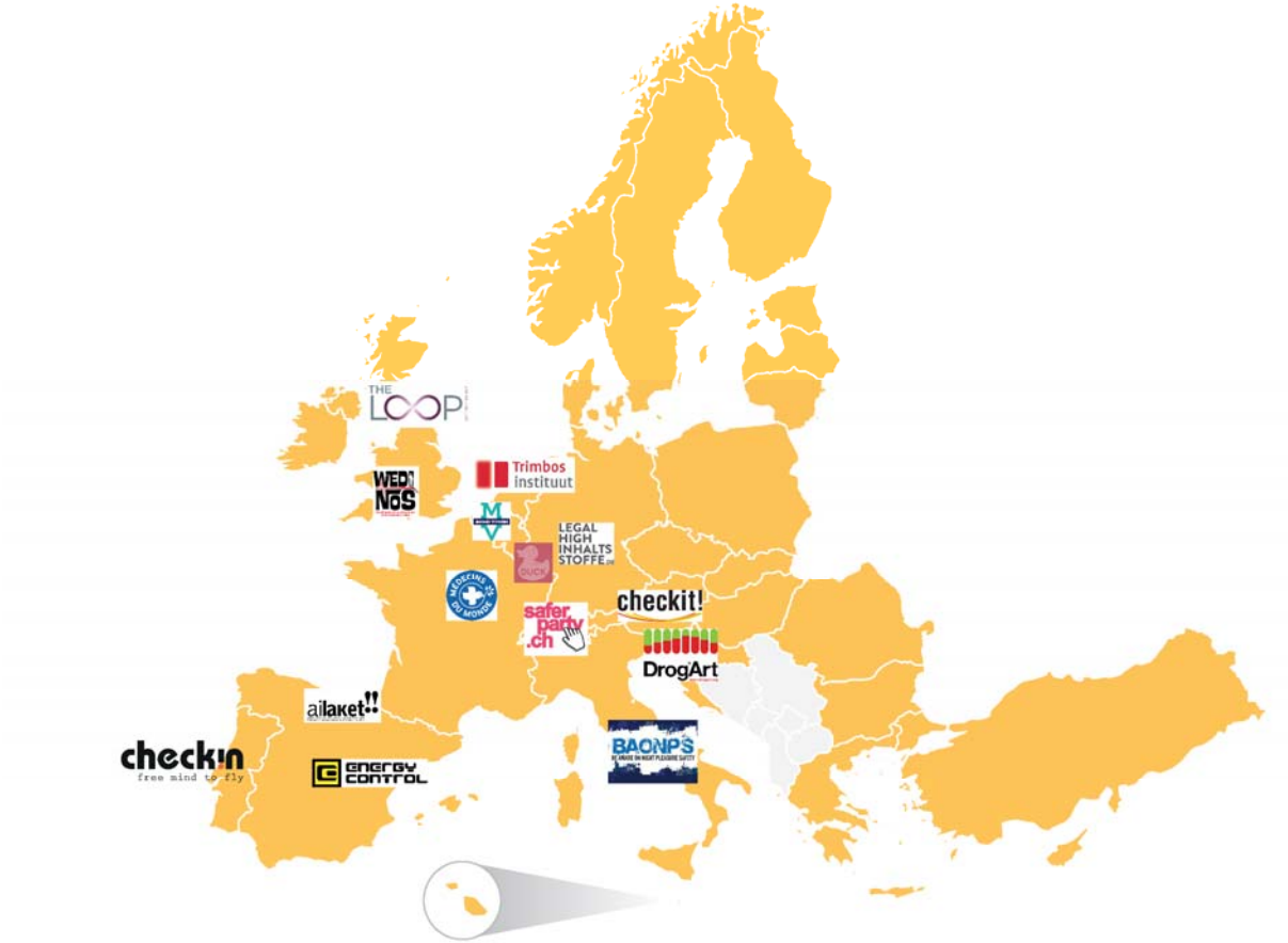
Figure 1 European drug-checking services in existence in 2017