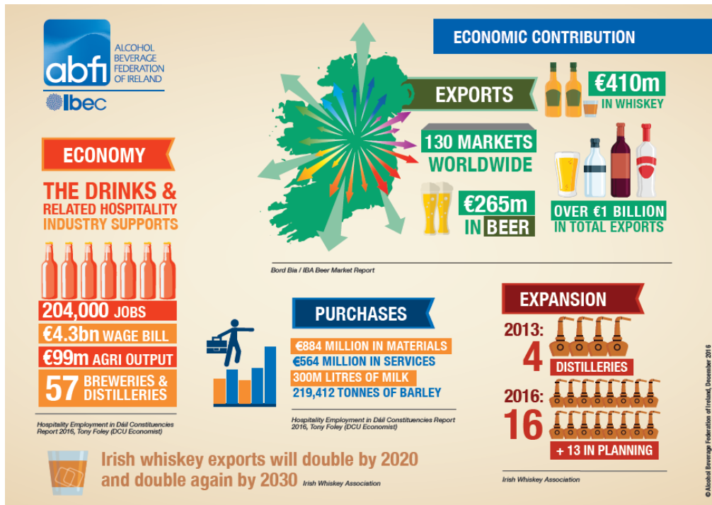
Figure 1 Economic contribution of the Drinks sector