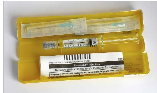
The naloxone kit approved for use in the UK

In May 2013 the naloxone ‘kit’ Prenoxad became approved in the UK for use in opioid overdose emergencies by non-medical personnel. The kit includes a pre-filled syringe, product instructions, and relevant first aid guidelines. Approval was seen as an important step to widening availability. It meant GPs could prescribe kits to suitably trained drug users and with their permission to their associates and families. Patient group directions also enable doctors to authorise pharmacists and nurses to supply the kits.