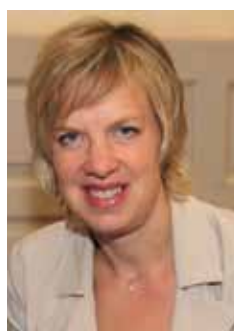
Senator Ivana Bacik