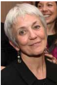
Paula Meehan, Ireland Professor of Poetry