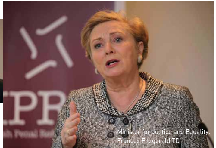
Minister for Justice and Equality, Frances Fitzgerald TD