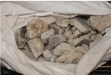
Calculation yield: approx. 1 300 000 MDMA tablets (120 mg concentration, average).