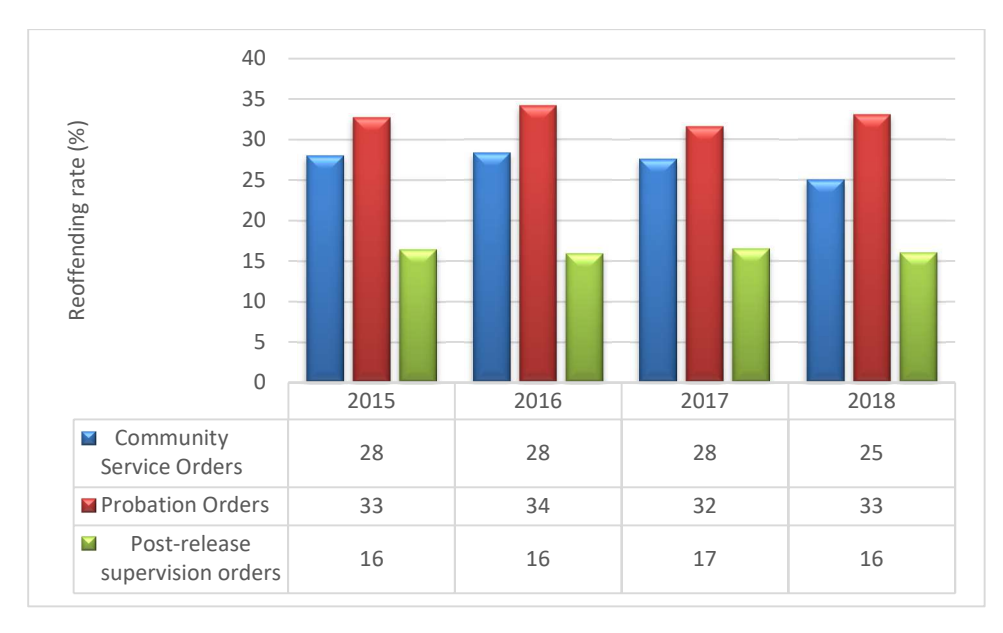
Figure T3.2.2 Proportion of Community Service Orders, Probation Orders and post-release supervision orders received, 2015 and 2018