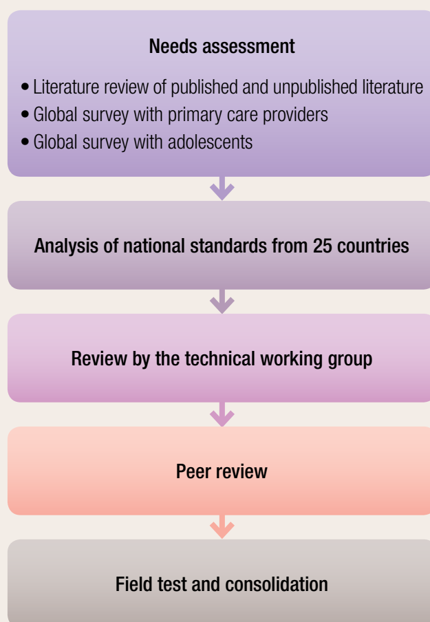
Fig. 1. The process for development of the global standards for quality health-care services for adolescents

WHO developed the global standards based on the needs assessment, which was informed by the literature review and online surveys, in conjunction with the analysis of 26 national standards from 25 countries: Bangladesh, Bhutan, Burkina Faso, Congo, Ethiopia, Ghana, India, Indonesia, Kyrgyzstan, Lesotho, Malawi, Mongolia, Myanmar, Nicaragua, Philippines, Republic of Moldova, South Africa, Sri Lanka, Tajikistan, Thailand, Ukraine, United Kingdom (England, Scotland), United Republic of Tanzania, Viet Nam, and Zambia. The analysis of national standards identified the most common standards 1 and their criteria, 2 which were then reviewed against the findings of the literature review and global surveys. Actions from