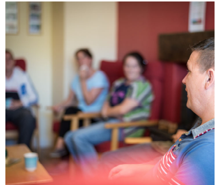
Our Polysubstance Misuse Group met weekly during 2014.

Recent years have seen a shift in the drug use of service users. With polysubstance misuse a worrying trend. The main drugs used would be benzodiazepines, alcohol and methadone