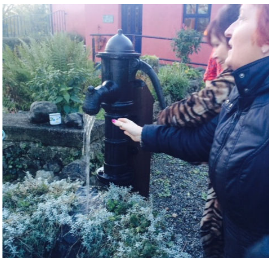
Some of the members of the Family Support Group on their retreat. This retreat was part-funded by the Local Drugs Task Force Respite Fund