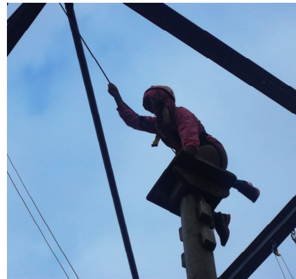
6th class to Secondary School can be a major change for these girls. Being part of a group can be a great support and stability for them during this time.

Topics covered include self-esteem, bullying, identifying supports within their family and the community, life skills and safety. This work is of enormous benefit to these children who are making a major transition in their lives.