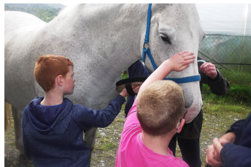
Spending time with animals can be very therapeutic for children living in a stressful environment.

This group has been a resounding success and we are actively researching fundraising opportunities to allow us to continue it.