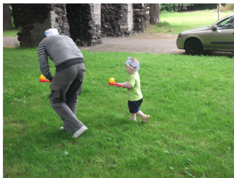
Toddle Waddle and Parents Afternoon 2014

Many thanks to the Oblate Community of St. Michael's who continue to facilitate us with the use of the DeMazenod Centre for our group work