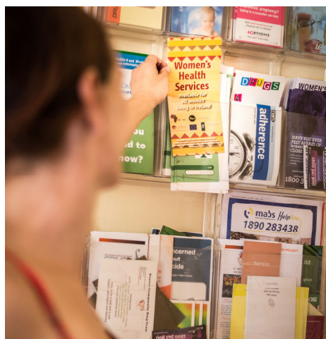
We held 167 Women's Groups during 2014 with an average of 11 women attending.

The Women's Group is facilitated jointly by the Canal Communities Local Drugs Task Force and IBCAT.