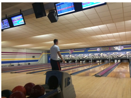
The Men's Group participate in workshops around Parenting, Active Listening, Conflict Resolution, Anger Management, Triggers to Use.