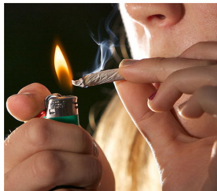
Our Cannabis Support Group meets weekly on a Monday evening.

We aim to continue this group throughout 2015 and maintain the steady attendance which we have had.