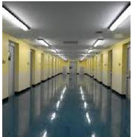
In 2014 there were 305 prison visits. The main prisons we visit are Mountjoy, Cloverhill and Wheatfield.

Our prison links worker also networks with other Community Prison Links workers in the greater Dublin area and with the Probation and Welfare services on behalf of the project.