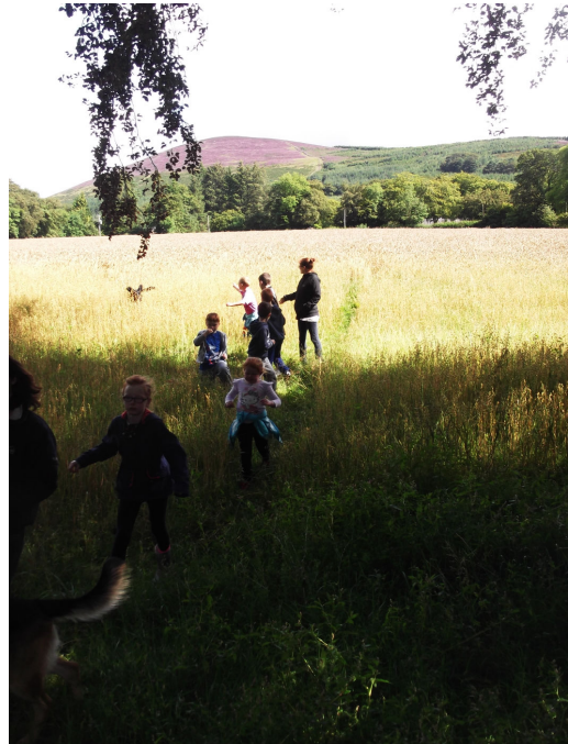
The summer activity programme is fantastic for the children. It introduces them to new experiences and most importantly is great fun!