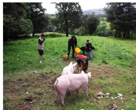
Trip to Causey Farm 2014