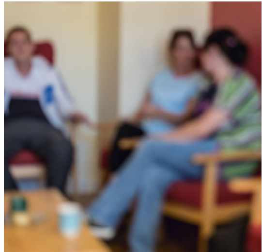
Above: Drop in provides a safe space for clients to socialise in a non-judgemental environment.

In 2014 we provided a harm reduction / needle exchange during drop-in each Friday from 4-5pm. This service was facilitated by the HSE.