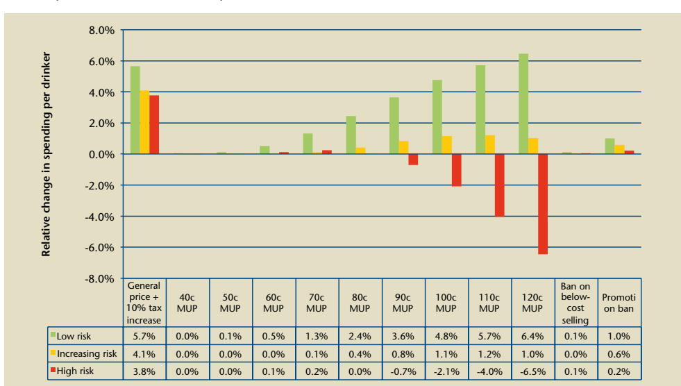
Figure 3: Relative effects of pricing policies on alcohol-related spending by type of drinker

Over the 20-year period modelled, the total societal value of the harm reductions resulting from a ban on promotions is estimated to be \notin 0.38 bn. This societal value equates to one-third that of a 90c MUP.