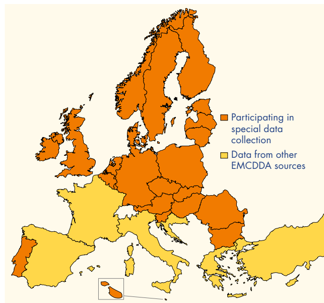
Figure 1: Countries covered in this publication

coverage or the effectiveness or evidence base of these interventions. The systematic assessment of the evidence base of interventions and the evaluation of their impact are important tasks, but are outside the scope of this publication. Based on the input from the responding countries, this Selected issue provides a broad overview, with examples drawn from a wide range of European countries, and constitutes a comprehensive picture of what Member States have done to help these vulnerable populations.