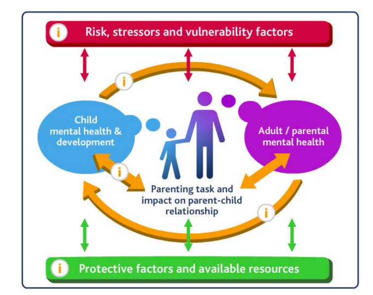
Figure 1 The Family Model

The model also identifies that there are risks, stressors and vulnerability factors increasing the likelihood of a poor outcome, as well as strengths, resources and protective factors that enable families to overcome adversity.