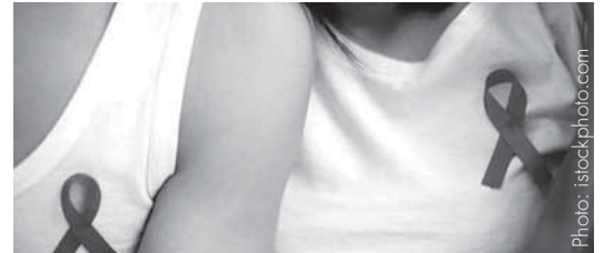
ECDC and EMCDDA launch enquiry into HIV outbreaks.