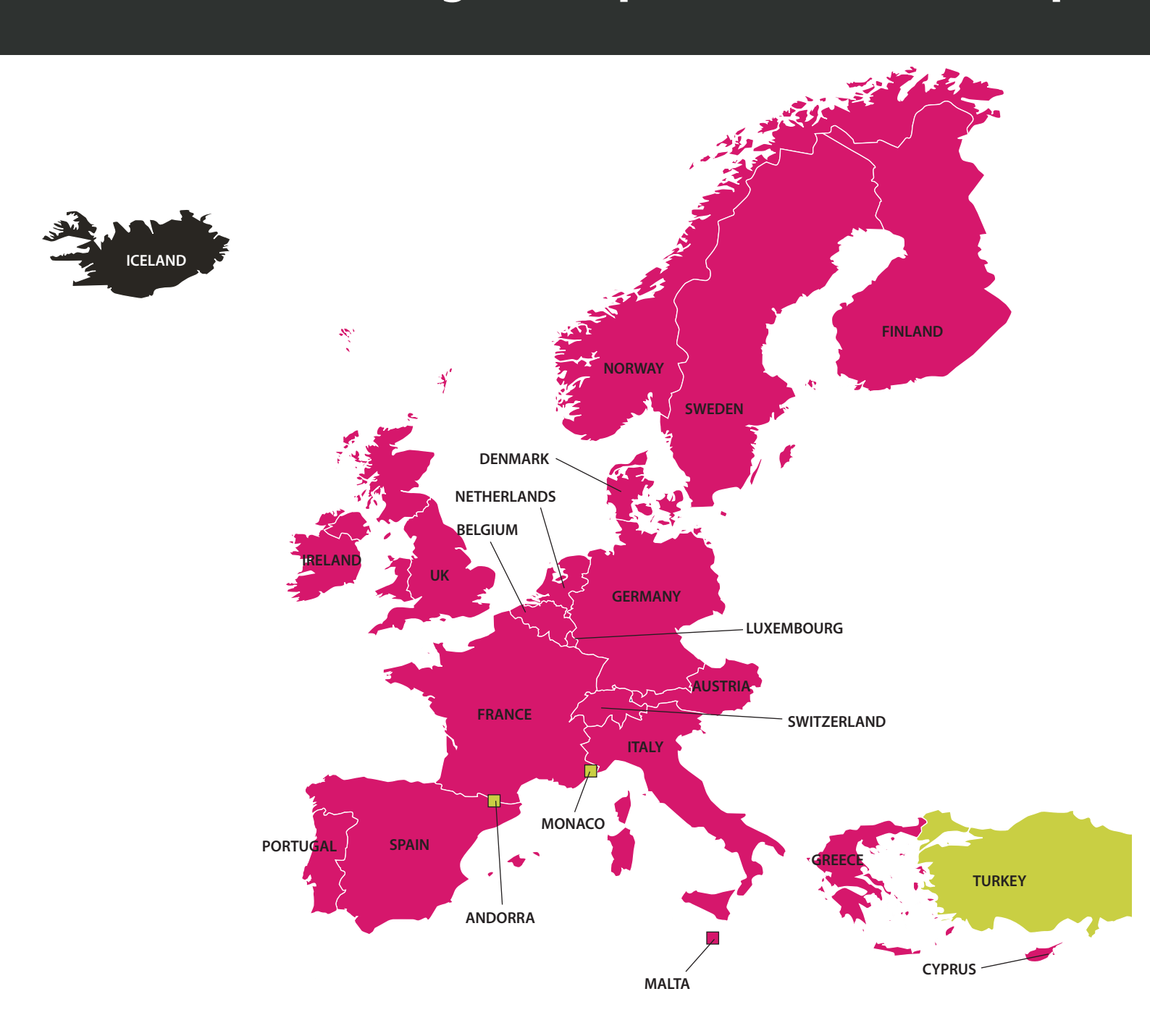
Map 2.3.1: Availability of needle and syringe exchange programmes (NSPs) and opioid substitution therapy (OST)