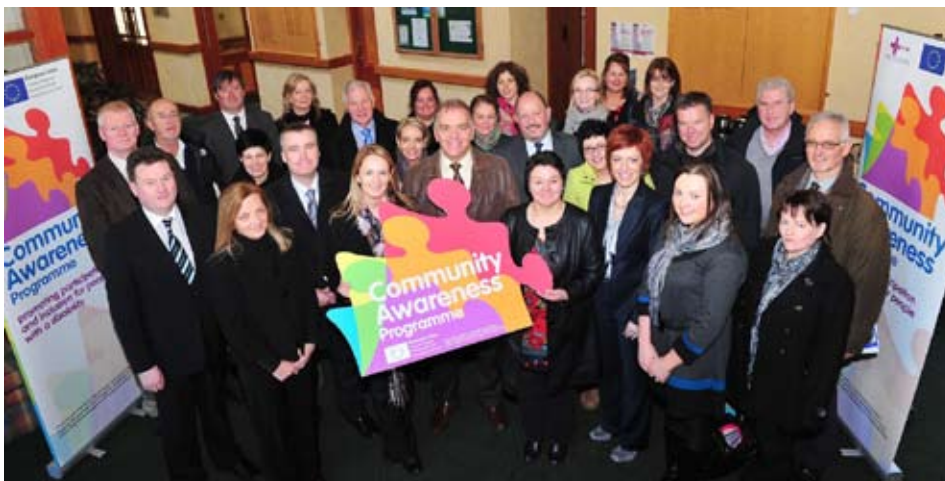
Pictured above are cross border attendees at the launch in Lifford Co. Donegal of the CAWT Community Awareness Programme supported by Strabane and Donegal Councils.

Interventions to be delivered under the Community Awareness Programme will be agreed and an action plan developed.