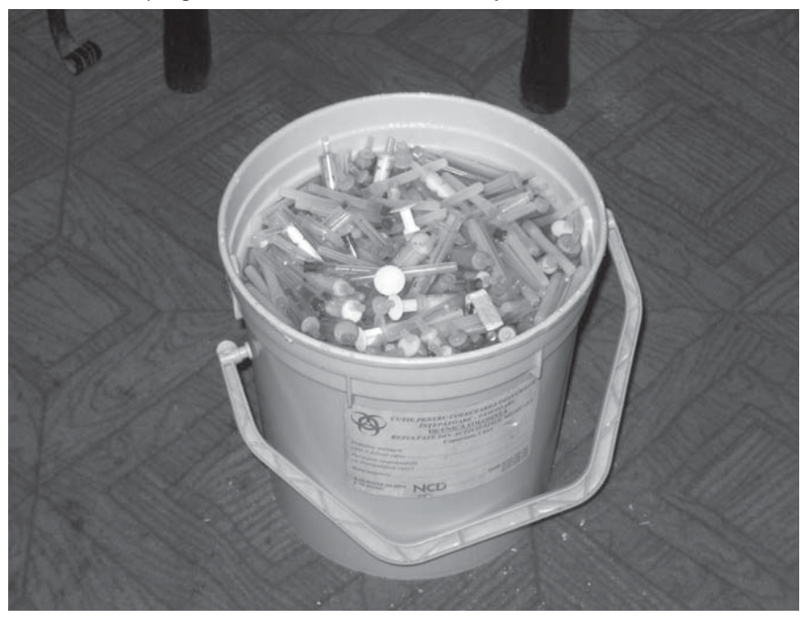
Used syringes are collected in disinfectant liquid and then incinerated

During their regular visits to the medical unit with the used syringes and needles, volunteers also provide information as to the number and type of other materials distributed, including condoms, medicines, alcohol wipes, booklets, etc. Their supply of such materials is replenished as needed, based primarily on demand and usage trends.