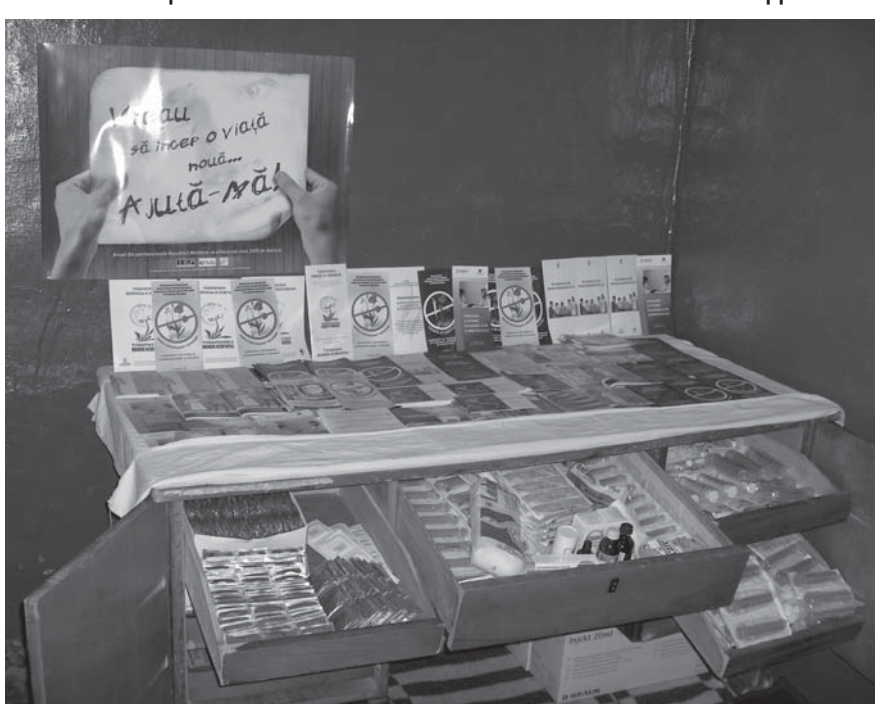
Volunteers provide information about HIV and health in addition to supplies

as one room with just two beds. The supplies are stored in small metal or wooden cabinets lined with shelves. Each cabinet has a door that is kept closed when supplies are not being distributed. The cabinets are locked only in Rusca, the women's prison, where only the volunteer has the key to open her cabinet. The cabinets are locked there to prevent theft, according to the medical director. Volunteers interviewed elsewhere said they and the medical staff had determined that locking the cabinets was a disincentive to project participation because it indicated that other prisoners could not be trusted. None of the volunteers interviewed in the men's prison colonies said they had ever seen evidence of theft. One added simply, "I'm always here anyway." Another said: "Our internal rules are very strict. Nobody touches anything unless I am here."