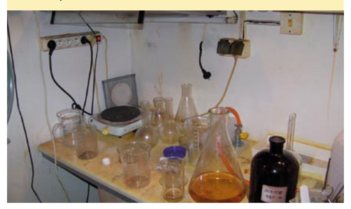
Figure 3. Small-scale methamphetamine production facility set in a garage, Czech Republic (2007)

However, compared to production in east and south-east Asia, North America and Oceania, much of which is done in large manufacturing facilities, the production of methamphetamine in the Czech Republic is small-scale. Most of it appears to be carried out in so-called 'kitchen labs' (see Figure 3) operated by 'cooperatives' or 'squads' of users for their own consumption (Zábranský, 2007), and they obtain the precursors, especially pseudo-ephedrine, from cold remedies sold without prescription in pharmacies (12).