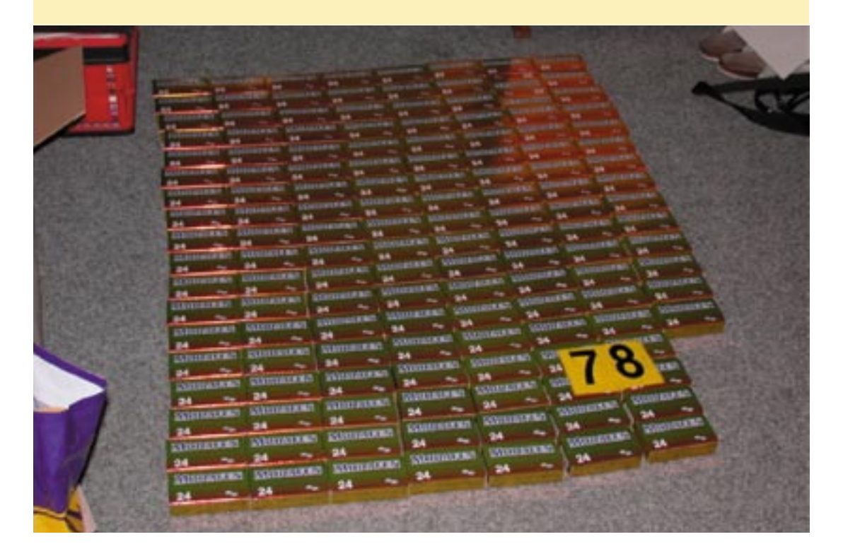
Figure 2. Seized packages of over-the-counter cold remedies containing pseudo-ephedrine used to manufacture methamphetamine in the Czech Republic (2007)

The synthesis of the precursors with other chemicals into the end-product methamphetamine is relatively simple. However, most methods involve flammable and corrosive chemicals and may therefore cause serious injuries and even death, while producing varying amounts of toxic waste that are often disposed of unsafely and may cause environmental damage (see box on page 17).