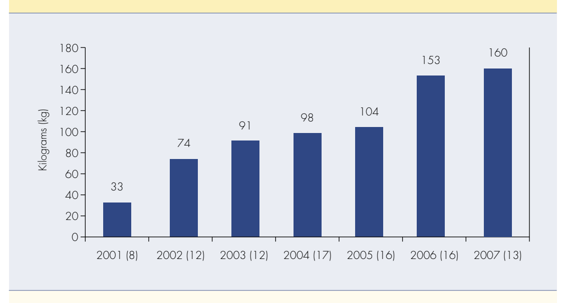
Figure 5. Trend in amounts of methamphetamine seized reported to the EMCDDA 2001–06 and Europol 2007

Note: The number in parentheses shown after each year is the number of countries reporting seizures above 0 grams. Source: Table SZR-18, Quantities (kg) of methamphetamine seized — 2001 to 2006, EMCDDA Statistical bulletin; Europol 2008a.