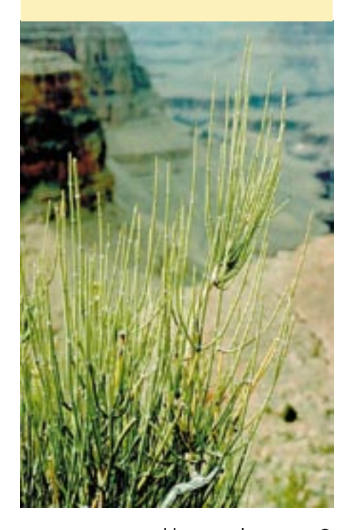
Figure 1. Ephedra vulgaris

In the 1920s and 1930s, the medical and paramedical use of methamphetamine and amphetamine (Benzedrine, Dexedrine) increased in Europe and in the West in general. For instance, amphetamine was prescribed for depression and other mood disorders in the United Kingdom, but was also sought out for its stimulant effects (by students, for instance). Problematic side effects of chronic and non-medical use of amphetamine, including hypertension, depression, dependence, and psychiatric disturbances have been documented since the late 1930s (ACMD, 2005). Nevertheless, both amphetamine and methamphetamine enjoyed widespread acceptance as safe and beneficial drugs among the medical profession and the public at large, well into the 1960s.