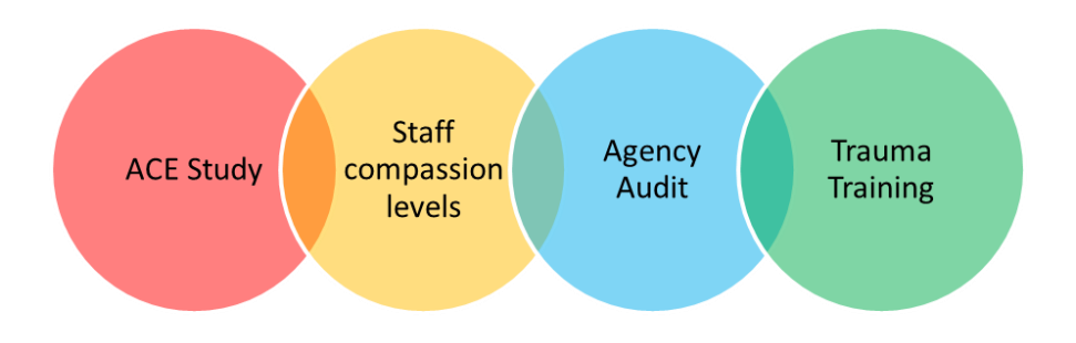
Fig 1.0 Model of TIC Implementation

The model (Fig. 1.0) offered an integrated exploration of the experiences of service users, and staff in parallel with the organisation they operating within. The information gained from these micro and macro perspectives informed the content of the trauma training as a means of amplifying existing strengths while shoring up skills and service deficits.