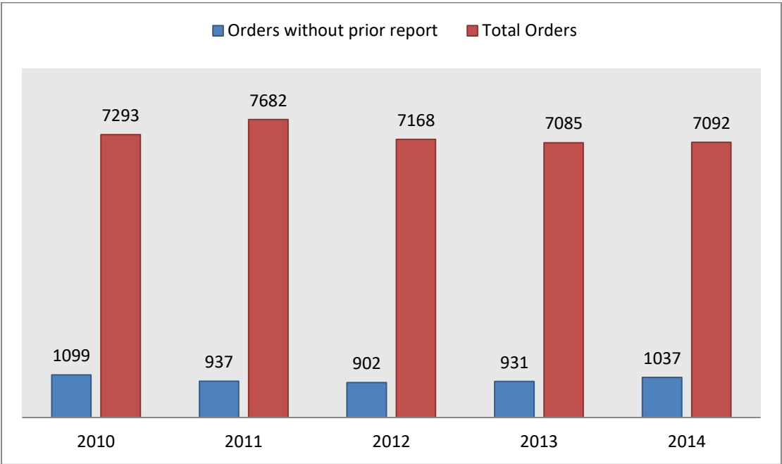
Table 3: Community Supervision Orders without a Prior Report and Total Community Supervision Orders

Data source: Probation Service Annual Reports (2010-2014)