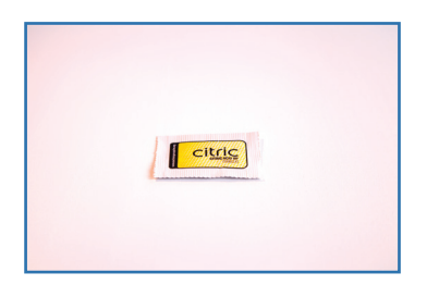
A citric packet, citric is used in the process of preparing drugs.