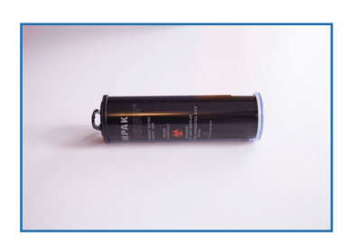
A personal sharps bin, used to safely dispose of used drug paraphernalia.