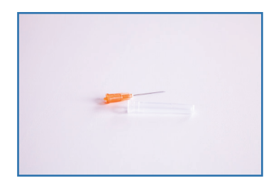
A needle and cap, not affixed to a syringe barrel.