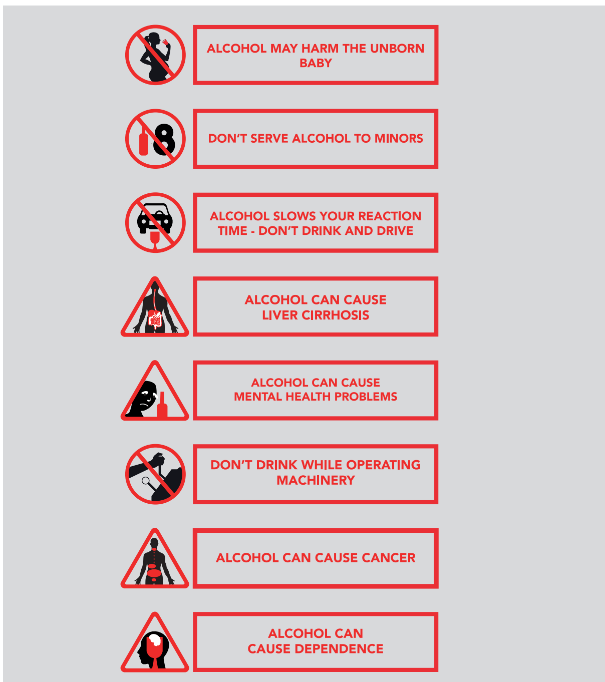
Fig. 5. Examples of warning text and pictograms for alcoholic beverages

by the United States public following its introduction. Similarly, pregnant women who saw the labels were more likely to discuss the issue; in addition, a “dose–response” effect was found such that the more types of information the respondents had seen (on adverts at point of sale, in magazines and on containers), the more likely they were to have discussed the issue (43). In France, comparable results were found in relation to the introduction of the pictogram in 2007 (Fig. 4). A study of public awareness regarding the dangers of drinking alcohol during pregnancy indicated a positive evolution in terms of changing the social norm towards “no alcohol during pregnancy” (46). Furthermore, information label messages may serve to legitimate a socially challenging intervention, such as increasing activities that aim to reduce the likelihood of an inebriated person driving a vehicle.