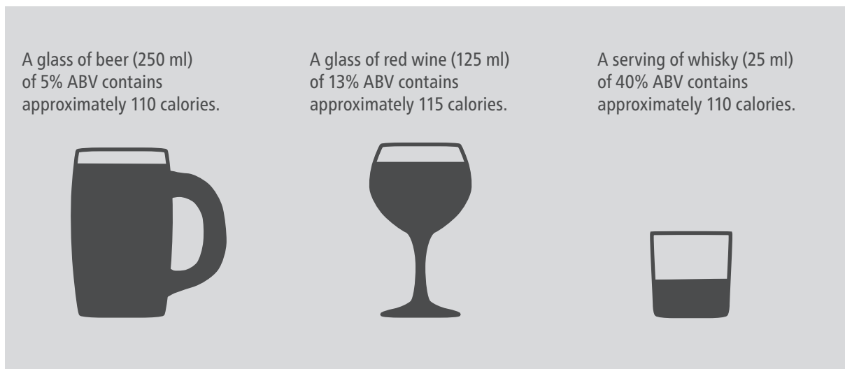
Fig. 2. Calorie content in beer, red wine and whisky

Being high in sugar means alcohol contains a considerable number of calories (Fig. 2), with an energy content of 7.1 kcal/g – only fat has a higher energy value per gram (9 kcal/g). Research suggests that alcohol consumption may represent a sizeable risk factor for weight gain (23–28). For instance, alcohol has been found to account for approximately 10% of adult drinkers' total energy intake on average in the United Kingdom and 16% in the United States (29), with men consuming about three times as much as women. Furthermore, surveys show that the populations of the United Kingdom and the United States generally have poor knowledge of alcohol calories, with four out of 10 unaware of alcohol calories and their food equivalents (30).