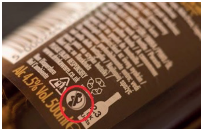
Fig. 4. Pregnancy pictogram in France

If pictograms are used, it is preferable that they are accompanied by a corresponding health information message. Furthermore, as on tobacco products, the specific size of the health information could be determined as a minimum percentage of the size of the container. The images used can be informational in style and taken from other ongoing education campaigns to enhance their effectiveness. Noticeability would be increased by placing the image on a contrasting background, with warnings printed in red rather than black (41).