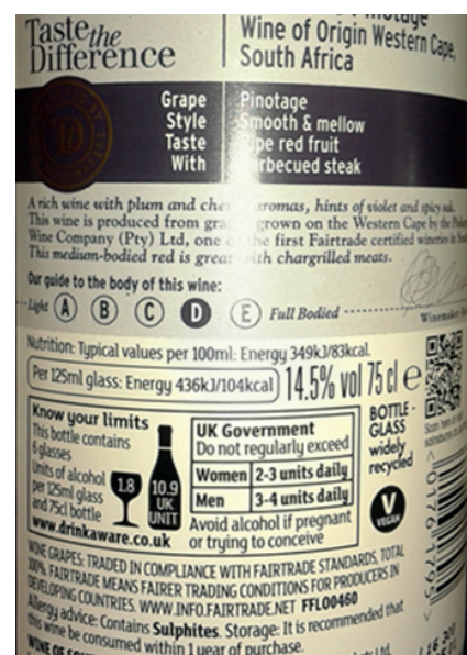
Fig. 6. Wine label in the United Kingdom from a supermarket's own brand

In addition, there is a growing acceptance of the key role that governments play in positively influencing consumers' dietary choices; to do so, they may use a range of preventative health approaches, including food labels where appropriate (3). Unfortunately, studies from the United Kingdom have found that a voluntary pledge by industry to provide information on the calorie content of alcohol did not lead to any significant provision of such information to consumers (47). Fig. 6 shows one of the few examples of a label produced in accordance with the pledge. Product-labelling regulation is an important instrument in promoting healthier habits and public institutions are ideally positioned to utilize it.