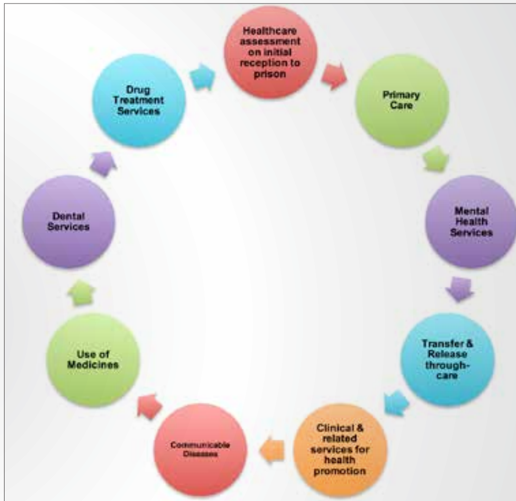
Fig. 2 Nine healthcare standards of the Irish Prison Service

The healthcare standards for the Irish Prison Services were completed in 2011 and the aim is to provide prisoners with access to the same quality and range of health services as those that are available to the general population. Nine healthcare standards were developed: