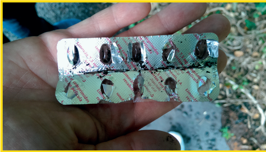
Photo 14: Empty blister pack of limovan (imported z drug) in visible site in Community 3

Other discarded empty prescribed medication packets included the following drugs: methadone, antidepressants, antipsychotics, pain medications such as tramadol, tylex and lyrica. Discarded aerosol cans were found in local parks in Community 1 and 2.