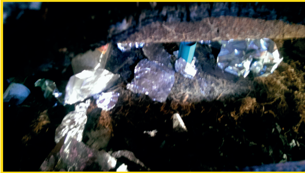
Photo 6: Hiding place within secluded site containing equipment for smoking drugs: homemade pipe and foil

The following photos were taken over a three week period in a secluded site in Community 3. They show evidence of smoking and injecting drug use.