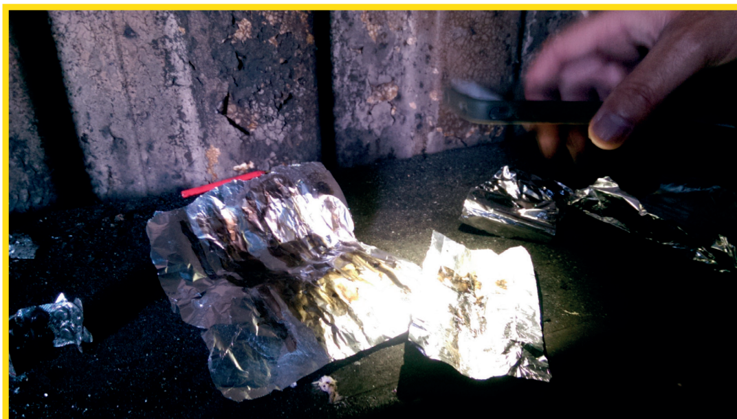
Photo 3: Foil with traces of heroin and an empty benzodiazepine blister pack

The following photos were taken over a three week period in a secluded site in Community 1. They show evidence of smoking and injecting drug use, and the use of benzodiazepines.