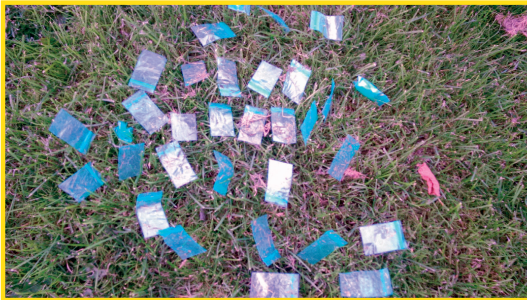
Photo 17: Empty drug bags scattered around a drug dealing site in Community 5

The researchers reported observing gangs congregating displaying drug related behaviour which created a sense of unease among the researchers. This occurred in two areas within two communities (Communities 2 and 5). A young person reiterated this intimidation: