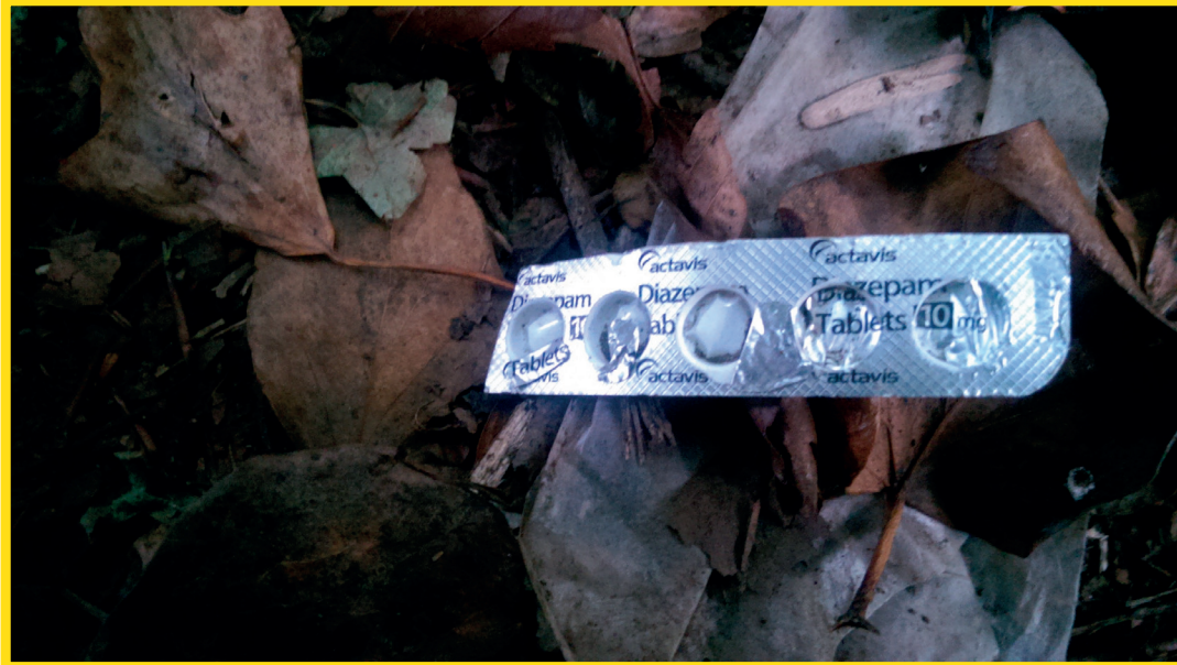
Photo 12: Empty blister pack of diazepam (benzodiazepine) in visible site in Community 2

There were discarded empty prescribed medication packets in all six communities. The majority of this litter was benzodiazepine and z drug packaging. The most z drug and benzodiazepine litter was found in Community 1 and 2; in Community 3 some of the empty z drug packs were imported types.