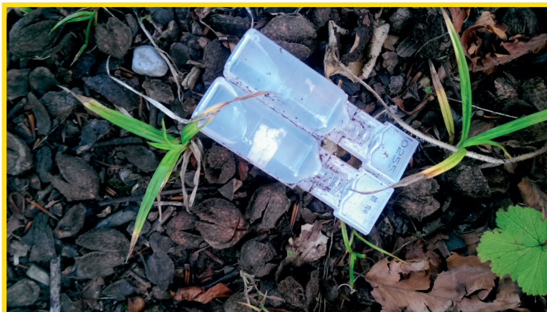
Photo 8: Evidence of injecting drug use: empty sterile water containers