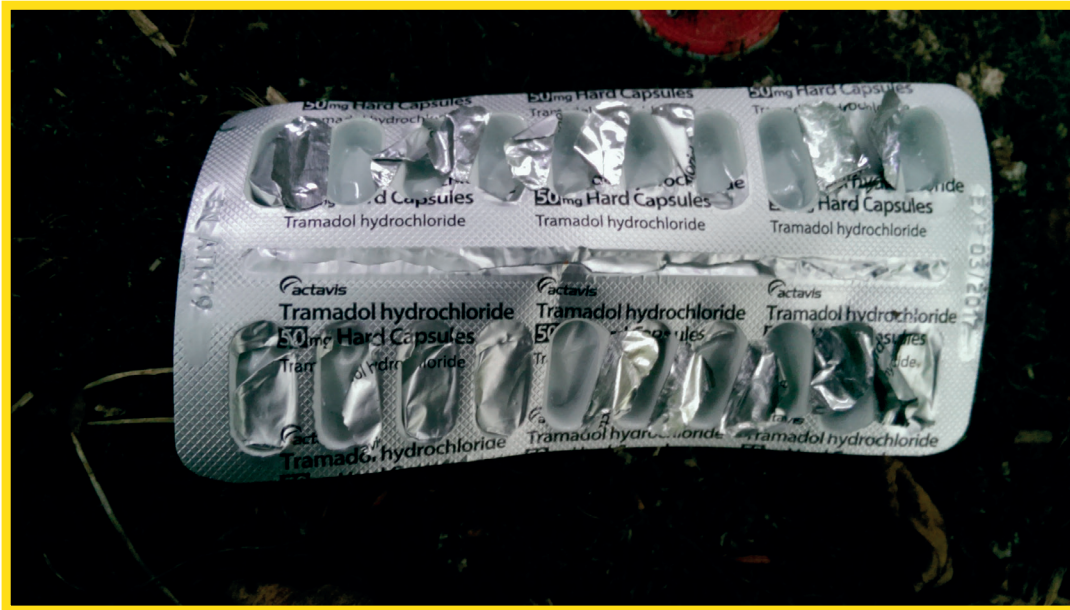
Photo 16: Empty blister pack of tramadol found in secluded site in Community 4