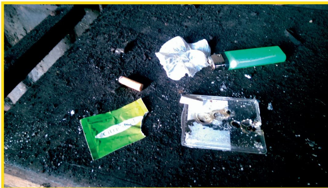
Photo 4: Evidence of injecting drug use: empty pack of citric acid and empty drug bag