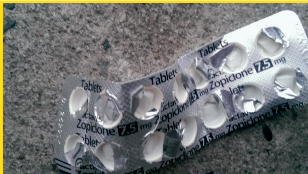
Photo 13: Empty blister pack of zopiclone (z drug) in visible site in Community 2