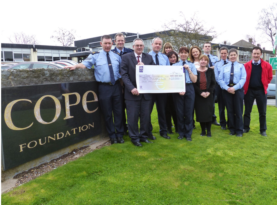
Pictured, Community Policing Mayfield handing over a cheque for €10,000 to the Cope Foundation.