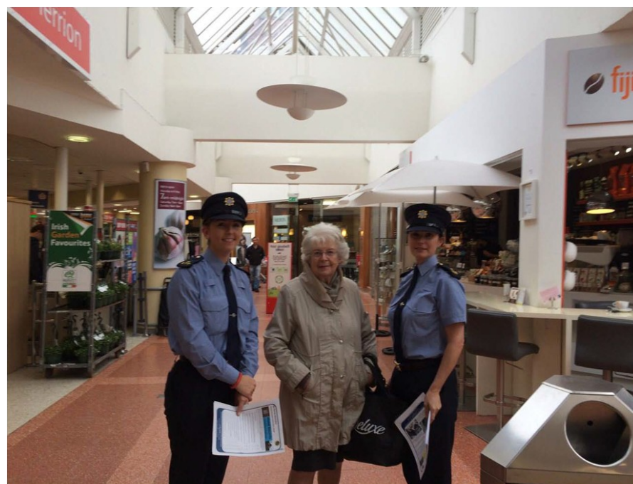
Community Gardaí interacting with and distributing Crime Prevention leaflets to members of the Community at Merrion Shopping Centre, Dublin.