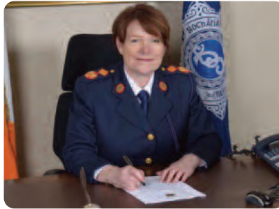
An Garda Síochána Commissioner - Nóirín O'Sullivan